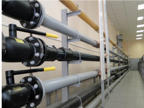
Fig. 1. The hydraulic bench with pipelines: fiberglass (first from the top), steel with an internal polymer protective coating (second from the top), polyethylene PE 100 SDR 17 (third from the top).

As mentioned above, the results have been processed using automated software programs. The experimental studies were carried out at a temperature of water and the environment of 16^{\circ} C. The L_o values for the tested pipe with an internal diameter of 0,09535 m have been the results of the experiments.