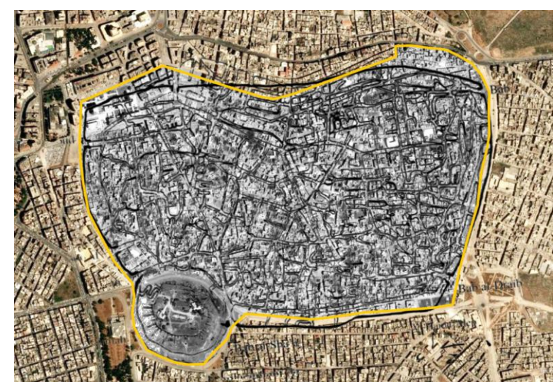
Fig. 1. The territory of the historical center of Homs city (Old town)

Homs city is considered the third largest city in Syria. Homs Situated in the central-western part of Syria, it is not only the administrative and industrial central-western part of Syria, but also one of the historical centres on the road between two historical cities, Damascus, the capital and Aleppo, with important historical and cultural significance that was first mentioned in the history of mankind back to 2300 BC. The old Homs is the core of the city; it was built inside its ancient walls, which have always been used to protect the city. In 1870, during the Ottoman era, the city expanded beyond its ancient walls, leaving an urban impact that still reflects the heritage of the past on our present [13].