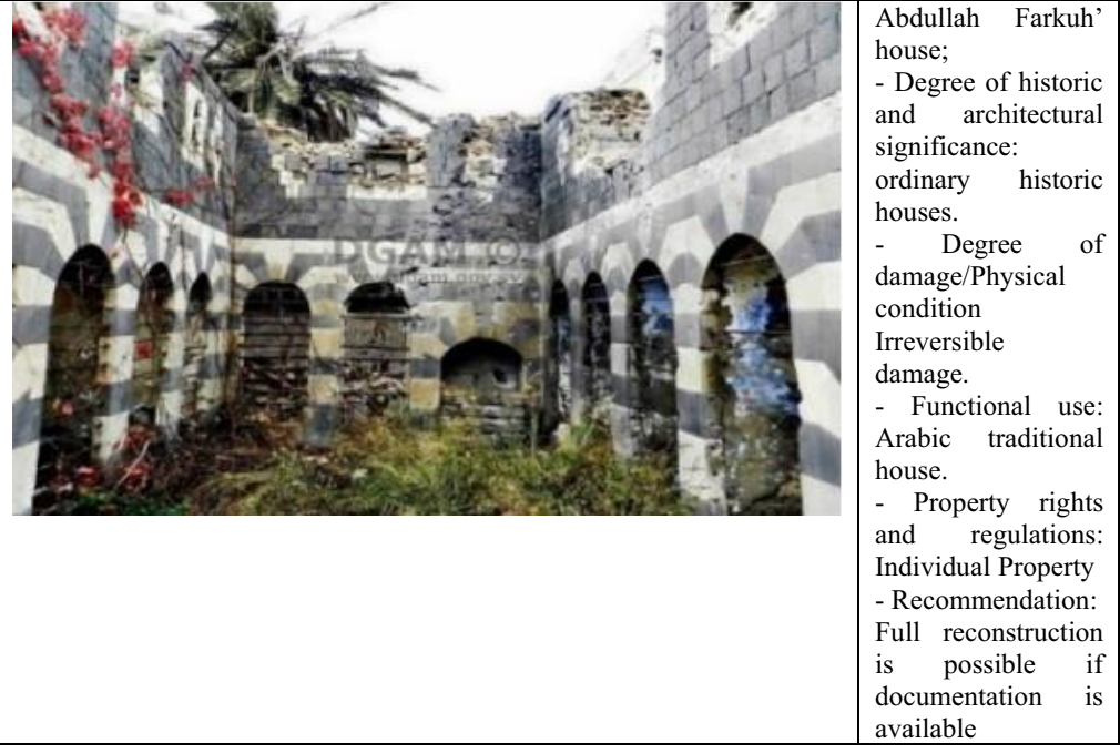
Fig. 2. Abdullah Farkuh' house, Homs, Syria.

The types of proposed interventions vary depending on where the conditions match in the algorithm, as seen in the following examples: