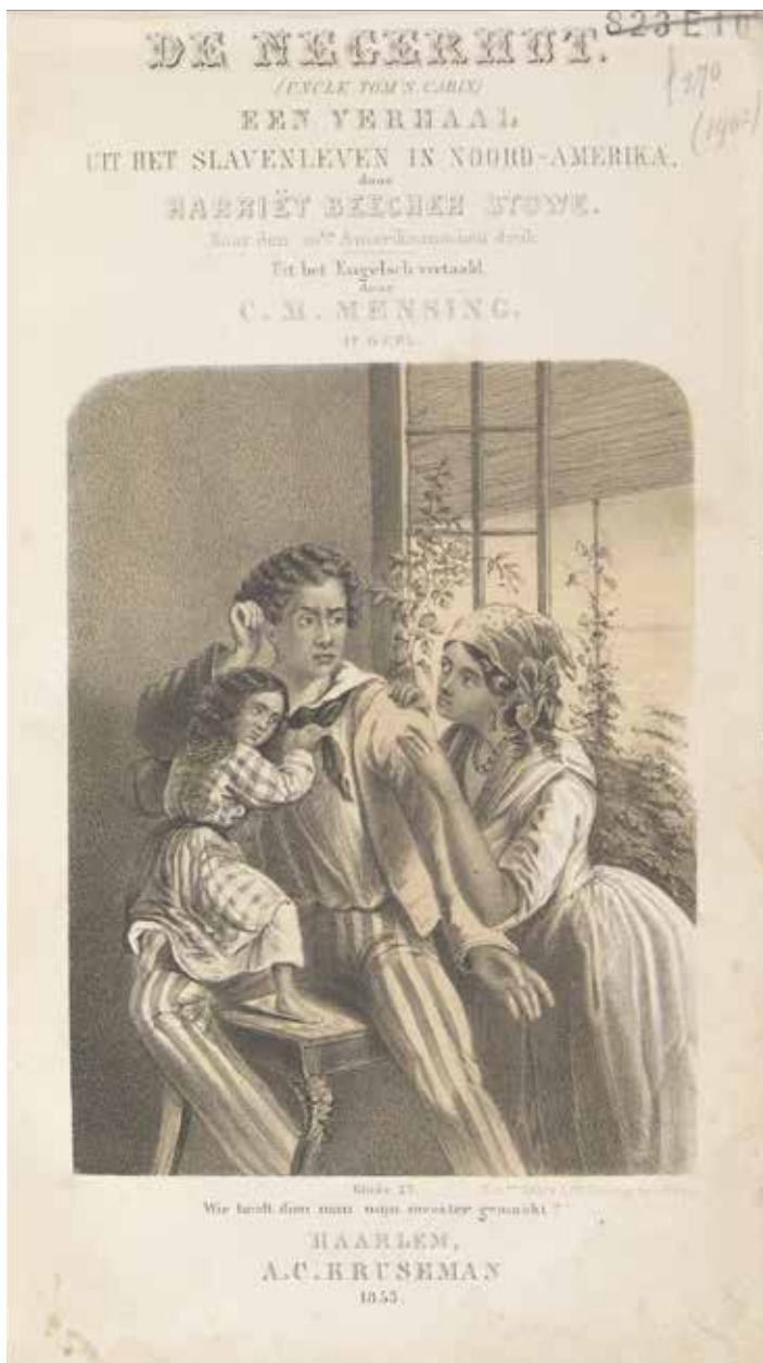
▲ Cover of the Dutch 1853 translation of Uncle Tom's Cabin , which was an important stimulus for the Dutch antislavery movement.