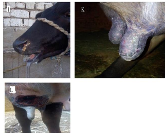
figure (3): I: Blisters in the mouth causing excess salivation of 2years old age cow as a complication of FMD; K: Rupture of vesicle of teat of 4 years old age cow as a complication of FMD ; L: Blister of the udder of 3 years old cow as a complication of FMD.

In this study E. faecium was isolated from a cow affected with LSD and was suffering from purulent osselets in the fore limb and udder fistula. Enterococcus faecium is one of the most important species of the genus Enterococci that includes 38 different species. It is a Gram-positive, facultative anaerobe that causes a variety of infections including, endocarditis, urinary tract infection, intra-abdominal infection and wound infection (Devriese et al., 2006; Murray et al., 2009 and Teixeira et al., 2011).