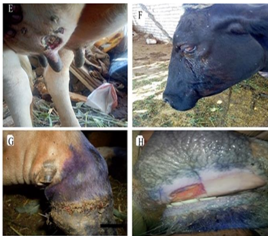
Figure (2): E: Udder fistula of 3years old cow as a complication of LSD F: Endophthalmitis of 4 years old cow as a complication of LSD;G: ruptured vesicle at coronary band of 1 years old bull as a

The third case was a cow affected with FMD and the clinical signs appeared as coronary band ulcer, swelling and blistering of the tongue. Bacillus Licheniformis is Gram-positive bacillus, spores of this bacterium reside in soil, bird feather especially chest, which make it desirable to be used for industrial purpose (Caldow et al., 1996). The presence of Bacillus Licheniformis as a complication of LSD and FMD may be attributed to the contamination of animal wounds with dust and soils.