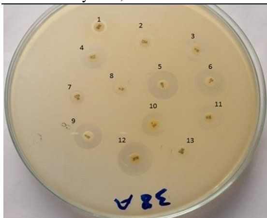
Fig (5): Sensitivity test using antibiotic disc.1 (AX= Amoxicillin), 2 (CZ= Cefazolin), 3 (K= Kanamycin), 4 (VA= Vancomycin), 5 (C= Cholmphenicol), 6 (DA= Clinddamycin), 7 (CTX= Cefotaxime), 8 (P= Penicillin), 10 (F= Nitrofurantoin), 11 (NA= Nalidixic acid ), 12 (TE=Tetracycline) and 13 (STX= Sulfamethoxazole-trimethoprim).

Trueperella pyogenes ( T. pyogenes ) is a species of bacteria that are non-motile, facultative anaerobic and Gram-positive. over the last decades, T. pyogenes has been implicated as a cause of different clinical manifestations in domestic animals (Radostits et al 2007 and Greene et al 2012). Quinn et al (2011) stated that bovine intramammary infections caused by T. pyogenes are associated with the highest somatic cell count (SCC) in milk and significant losses in milk yield, as well as high percentages of nonfunctional quarters. T. pyogenes is the most important bacterial risk factor for clinical mastitis. T. pyogenes infections have been usually described to cause pyogenic infections in livestock (Radostits et al. 2007) causing bovine mastitis. In our study the Trueperella pyogenes was isolated from a cow affected with FMD which clinically appeared as swelling of the gum, tongue and mastitis and claw affection. The infection may be due to contamination of the udder or occurred as a secondary infection, this agrees with Quinn et al. (2011). Sogstad et al. (2005) Stated that claw overgrowth was