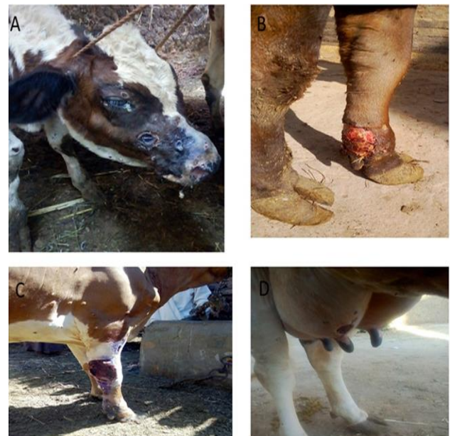
Figure (1): A: Sit fast nodules all over teat of 3 years old age cow as a complication of L.S.D B: Purulent osselets of 1 year old age bull as a complication of LSD C: Blister of fore limb of 3 year old age cow as a complication of LSD D: Udder nodules as a complication of LSD of 3 years old cow.