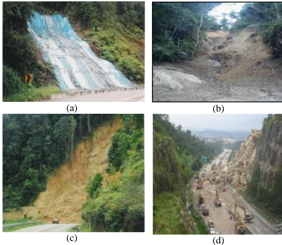
Figure 1: Some common types of landslides in Malaysia (a) Shallow slide, (b) Debris flow, (c) Deep seated slide (d) Rock fall.

Landslide assessment for the purpose of estimating the probability of occurrence and likely severity of landslides can be carry out by various methods, namely the statistical method, landslide inventory method, heuristic approach and deterministic approach (Varnes, 1984; Soeters & van Westen, 1996; Van Westen et al. , 1997 and Hussein et al. , 2004). Ali (2000), Rosenbaum et al. (1997) and Tangestani 2003) describe an attempt to use fuzzy set theory analysis, while Kubota (1996) and Yi et al. (2000) use fractal dimension, a mathematical theory that describes the quality of complex shapes of images in nature, in evaluating landslide hazards.