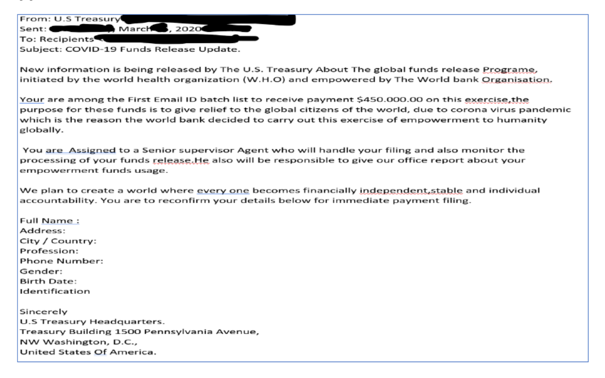
Figure 1. Phishing Email Example