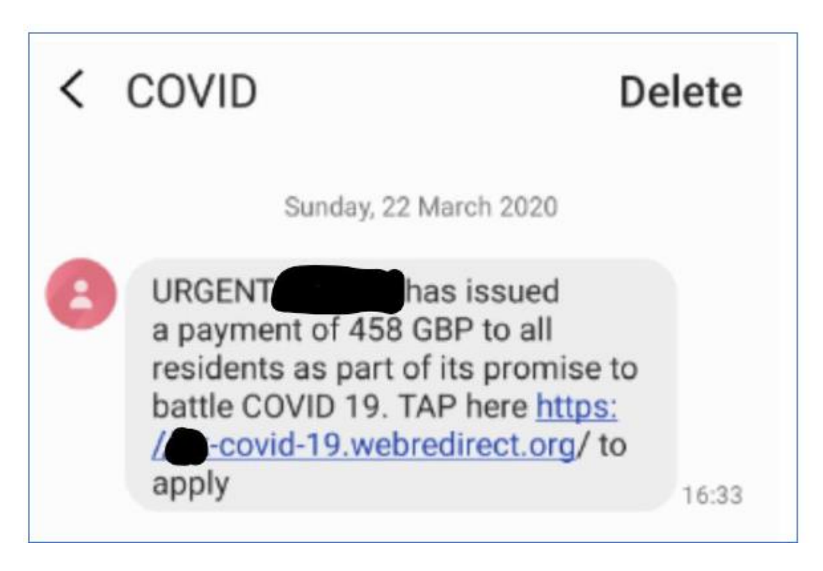
Figure 3. Text Message Example 2