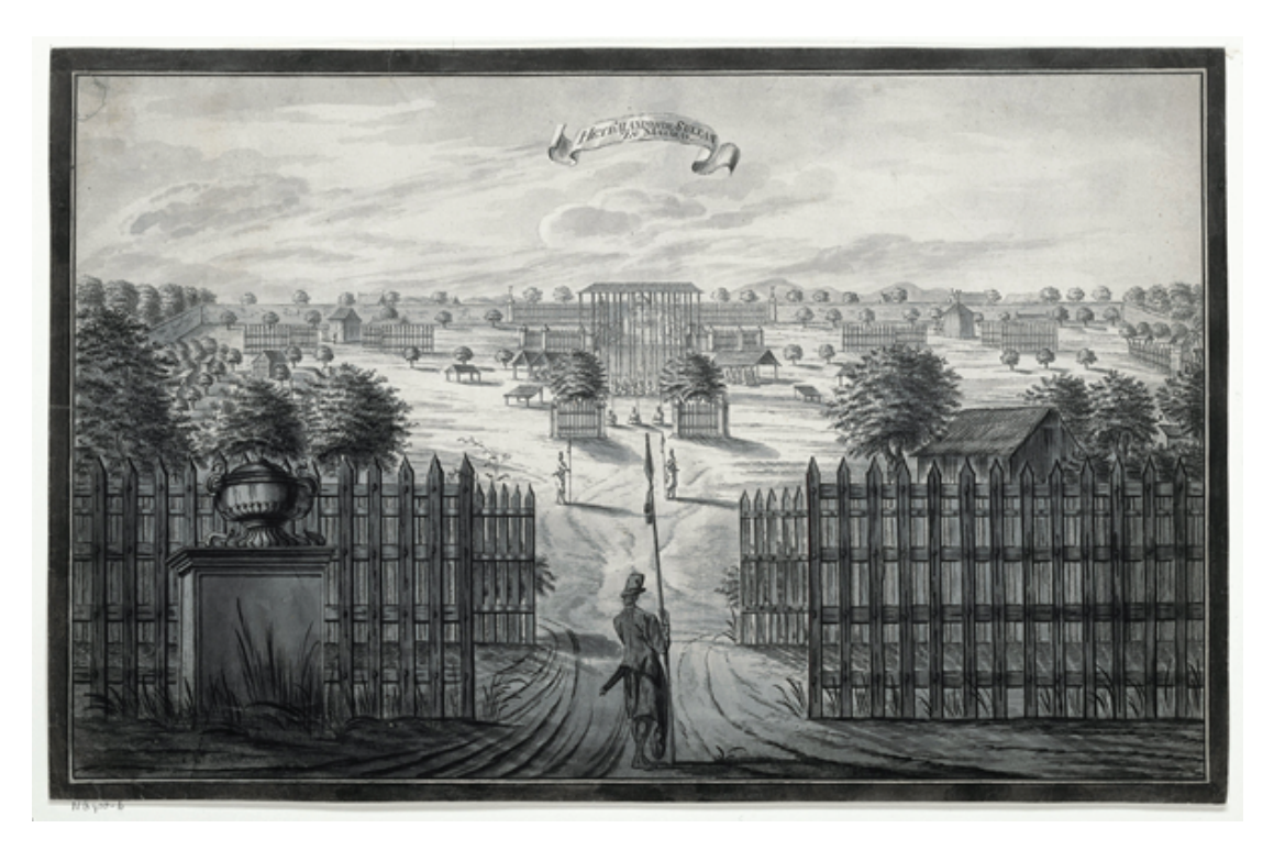
Figure 1: A. De Nelly, Palace of the Sultan, Yogyakarta, 1771. Brushdrawing in ink, 32.7cm x 49.5cm. Caption: "De kraton te Djocjakarta Het d'Alam van de sultan Zu Mataran". Collection: Rijksmuseum nr NG-400-B

The earliest depictions of 'the East" in the 17<sup>th</sup> century accompanied accounts of missionaries or explorers, such as the famous accounts written by Olfert Dapper and Philippus Baldaeus. The illustrating artists did not travel to Asia themselves and had to resort to the written text to inspire their depictions. This practice had several consequences for the produced prints. Firstly, in many cases the artists were not familiar with the visual language of the region they were depicting. Instead, they adapted the described topics to the prevailing visual language in their western medium. The arrangement of elements used in common compositions of the 17<sup>th</sup> century fine arts, consisted mainly of creating perspective using several axes and dramatic shading. Secondly, the artists had limited exposure to depictions of local architecture, crafts and regional art styles. As a result, many pictures feature classical Greek pillars and arches. Hindu deities such as Ganesha were depicted with the proportions and body type of Greek gods. Few artists might have been familiar with depictions of Asian architecture such as the Chinese pagoda, of which elements were pasted into depictions of South-and South-East Asia.