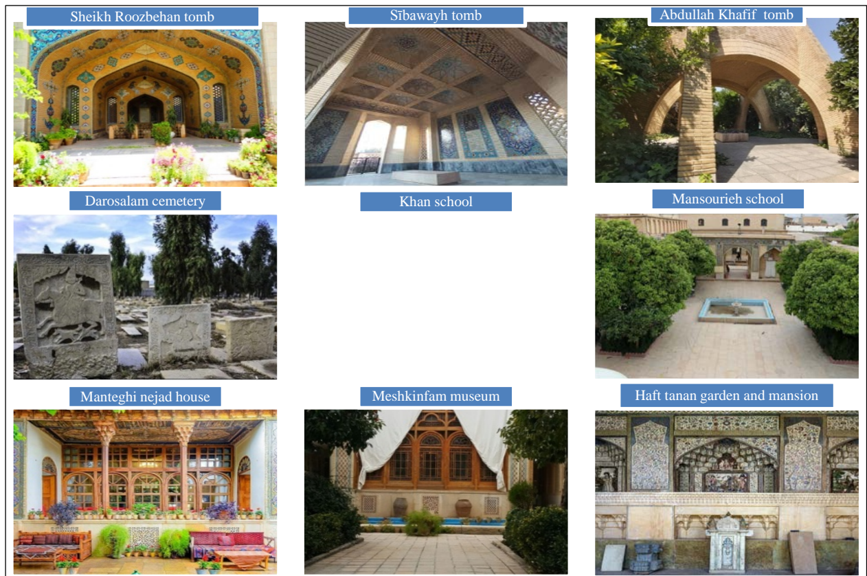
Figure 1: Small Heritage Sites in Shiraz