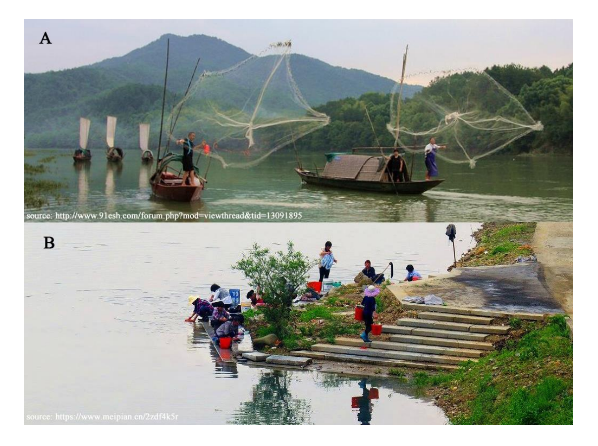
Figure 2 (A) Picture of Chinese traditional fishery activities; (B) picture of people washing clothes in the river in China (see source addresses in picture)