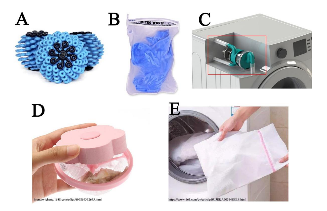
Figure 3 (A) Cora Ball (coraball.com); (B) Guppy Friend Washing Bag (us.guppyfriend.com); (C) XFiltra external laundry sewage filter(www.xerostech.com); (D) and (E) the in-drum laundry filter net and washing bag sold in China without special microfibre-block function (see source addresses in picture)