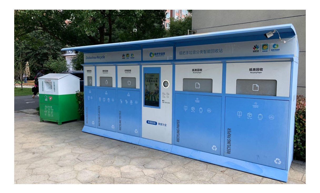
Figure 5 A second-hand clothes donation box (green box in the left) and a smart waste sorting device in Chinese community (at University of Nottingham, Ningbo China; blue device in the right). The waste sorting device can encourage residents to dispose of recyclables scientifically by paying rebates electronically or by accumulating credits.

(Chen, 2017; Wang, 2019). Smart waste sorting systems (i.e. sorting devices) have now been placed in local communities, in order to improve the efficiency of recycling old fabrics (see Fig. 5). In 2015, the used clothing materials collected by smart household sorting machines have reached 7% of total collected recyclables in Tianjin (Chen, 2017).