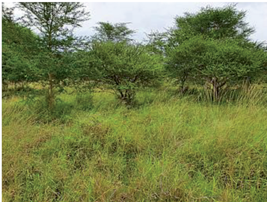
Figure 3. A typical vegetation of grass and shrub during the rainy season.