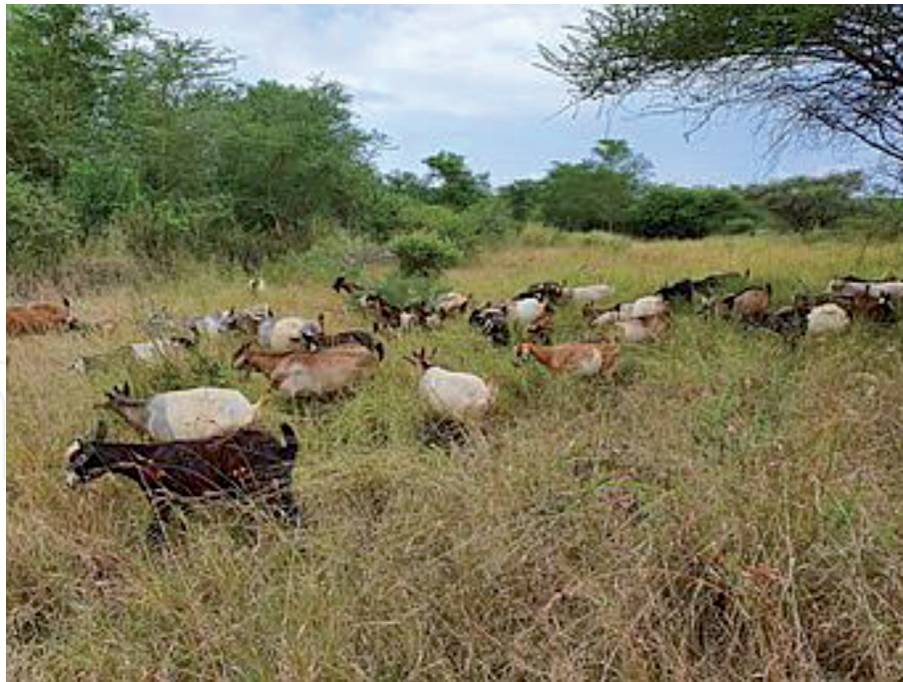
Figure 4. A herd of veld goats during dry season.

In Southern Africa, the veld quantity and quality are highly variable and represent the main limitation of livestock production [125]. In addition, the grassland is affected by seasonality, where the dry seasons are generally long and characterised with low quantity and quality veld [74]. A herd of veld goats are shown in Figure 4 .