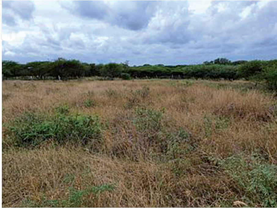
Figure 2. A typical vegetation of grass and shrub during the dry season.

Ruminants accumulate energy in adipose tissues when the quality and quantity of feed is sufficient, and mobilise it to meet energy requirements during periods of shortage [123, 124]. In a tropical environment, the rainy seasons alternate with dry seasons. The capacity to accumulate fat during the rainy seasons for its subsequent use for maintenance and biological functions (like pregnancy and lactation) in the dry season is an essential strategy for survival [124]. The typical vegetation of grass and shrub during the dry and rainy in Southern Africa are shown in Figures 2 and 3 , respectively.