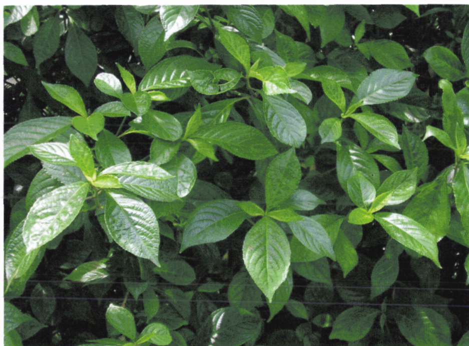
Figure 1.1 : Strobilanthes crispus ZII 109 (L) Bremek or Saricocalix crispus ZII 109 (L) Bremek (Acanthaceae)

One of the herbs that have great potential and is believed to have health-giving properties is “ pecah beling ” or Strobilanthes crispus (Figure 1.1). It is commonly known as “ daun pecah beling ” in Jakarta or “ enyoh kilo ”, “ kecibeling ” or “ kejibeling ” in Java (Sunarto, 1977). It is also locally known as “ pecah kaca ” or “ jin batu ”.