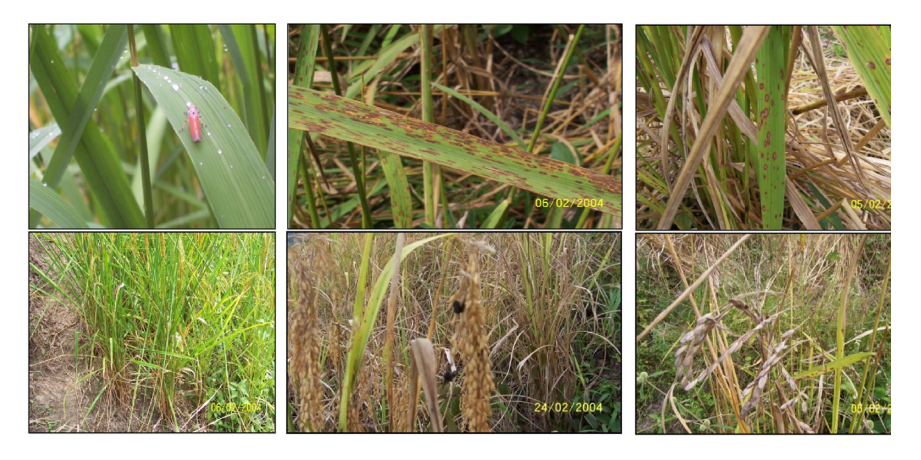
Photo 4: The most common symptom of nutrient deficiency, and pest and diseases of upland rice

This survey suggests that the collected upland rice varieties have not been fully exploited for commercial production. Furthermore, the majority of the upland rice farmers are dependent only on the nutrient in the soil without