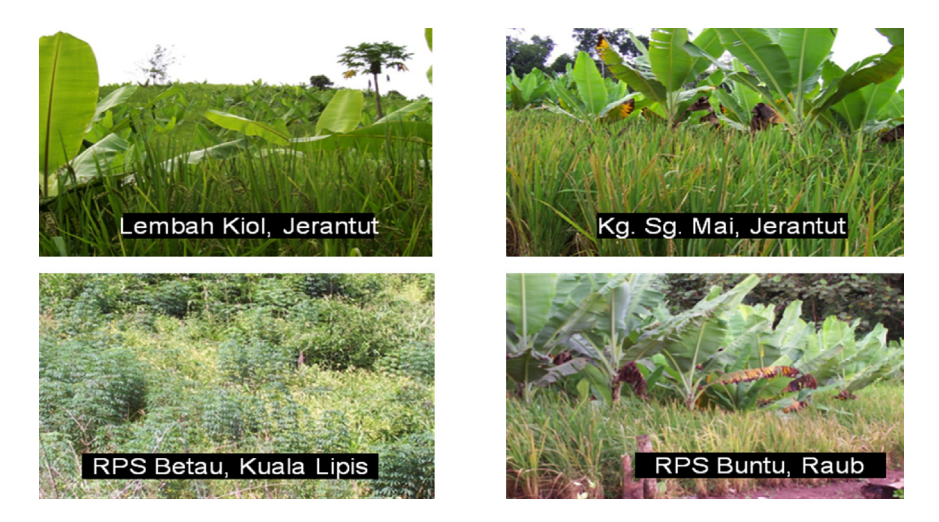
Photo 5: Competition between weeds and upland rice for plant nutrients, water, sunlight, and space in the field