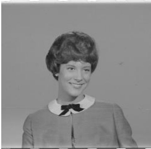
Figure 1.2a: Original image, girl

Figure 1.2a and 1.2b show an image before and after contrast enhancement. Notice