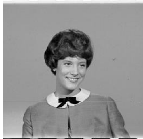
Figure 1.2b: after contrast enhancement

that the image shows better visibility after contrast enhancement. Many methods have been proposed and they can be generally classified into two main categories: intensity-based methods and feature-based methods (Zhu et al., 1999).