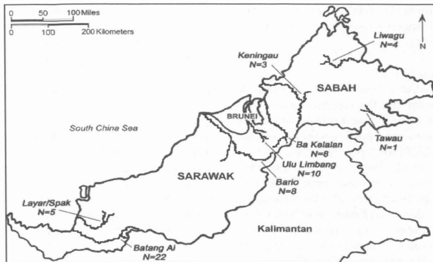
Fig. 1: Map showing sampling locations and sample sizes of T. douronensis collected for this study. N= sample size.

provided by the Indigenous Fish Research and Production Center (IFRPC), Tarat, Sarawak. The weight and standard length of the fish samples used in the study ranged from 50-500 g and 5-100 cm, respectively. Whole samples were morphologically identified by using the keys provided by Inger and Chin (2002), Mohsin and Ambak (1983), and Kottelat et al. (1993). Fresh samples in the form of full specimens, muscle tissues, scales or fin clips were placed in a -80°C freezer for long-term storage. However, in most cases, samples collected in the field were preserved in 95% ethanol and stored at -20°C prior to genetic analyses.