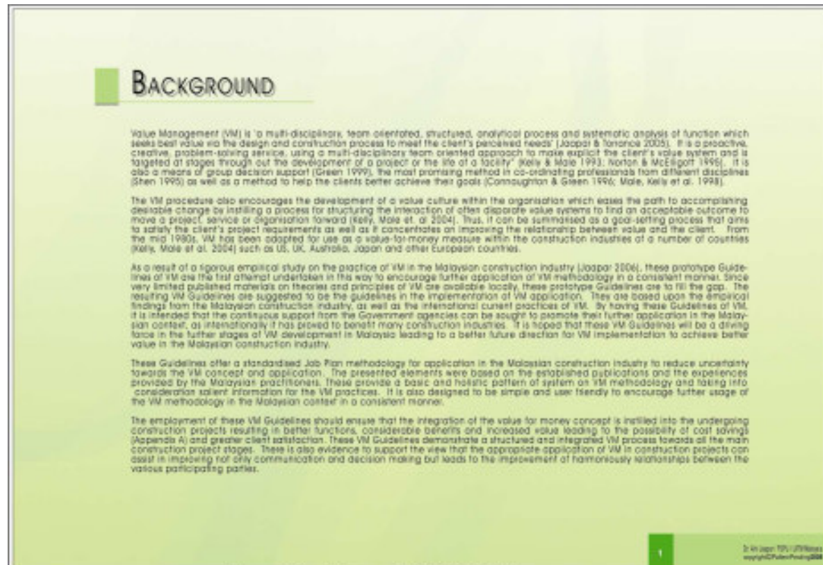
Figure 1: The Background of the VM Guidelines.