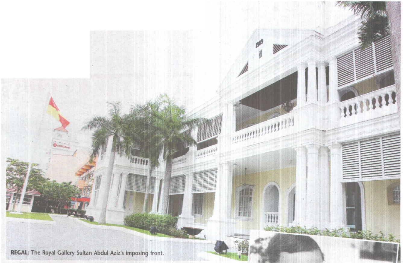
REGAL: The Royal Gallery Sultan Abdul Aziz's imposing front.

Royalty has long fascinated the common people. A royal museum in Klang provides a look at the life of Selangor's eighth sultan, writes ZANNA ES.