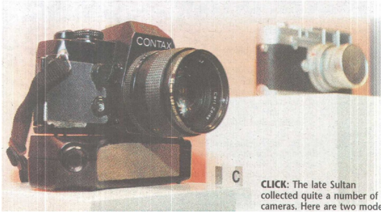
CLICK: The late Sultan collected quite a number of cameras. Here are two models.

The late Sultan's ancestry can be traced back to the Bugis Sulawesi family of Opu Tanreburung Daeng Relaka who featured in the history of the Malay Archipelago.