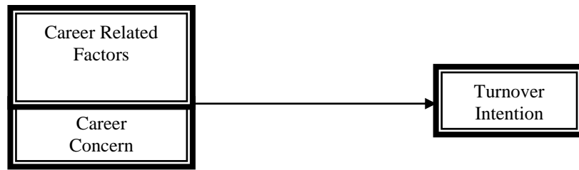
Figure 1: Proposed model of the Study

Hypthesis2: Career concern is positively related with turnover intention.