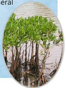
FIGURE 1 Conceptual representation of the principal causes of loss of genetic diversity in the marine environment, including relevant examples from around the world.