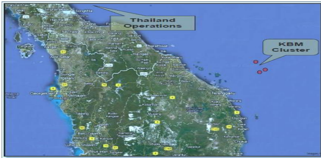
Fig.1. Kapal, Banang and Meranti Fields (KMB) Offshore Peninsular Malaysia