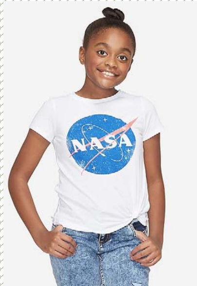
Price: $19.95 Justice