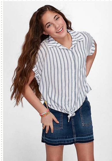
Price: $24.95 Justice