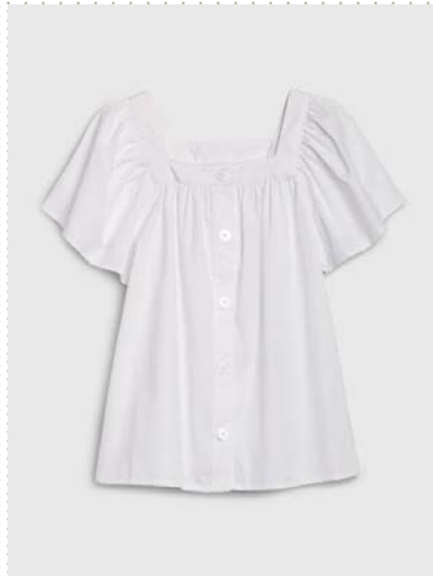
Price: $39.95 Gap Kids