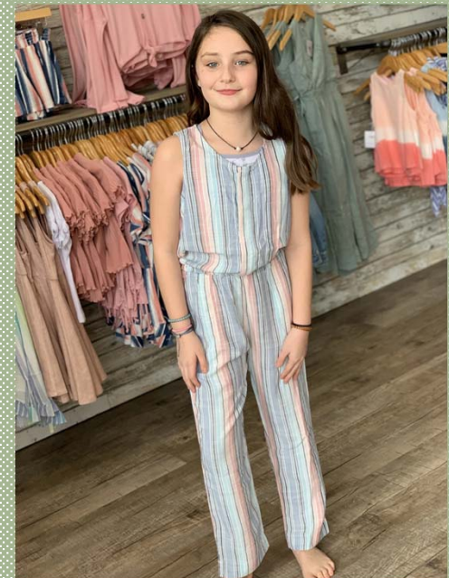
Price: $54.00 In between