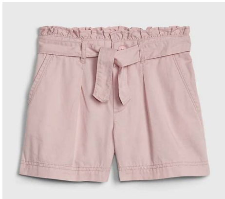
100% cotton Price: $25