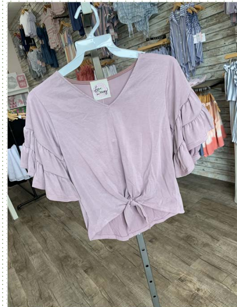
Price: $33 In between