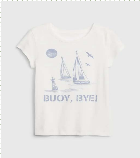
Price: $16.95 Gap Kids