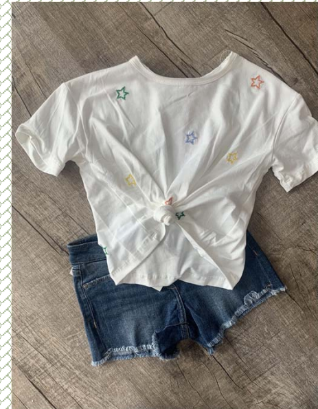
Price: $37.00 In between