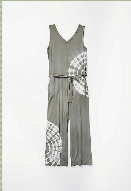
Price: $34.95 Justice