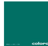
100% cotton Price: $45