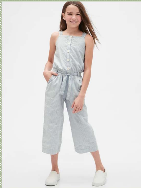
Price: $59.95 Gap Kids