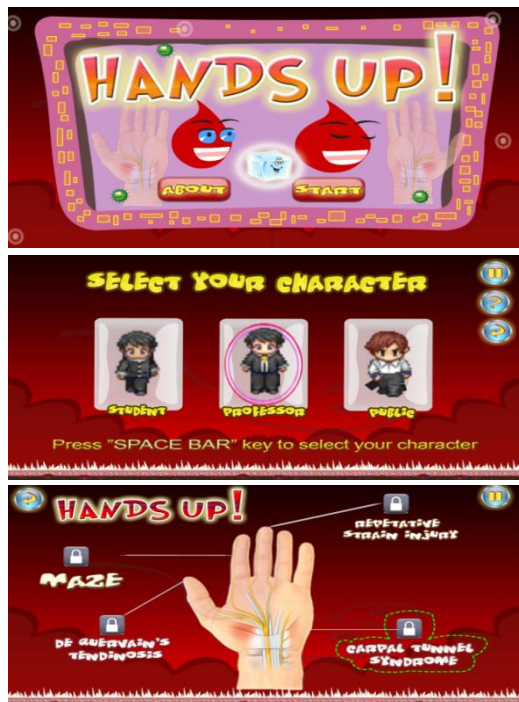
Table 2. Example of Screen Design Before User's Feedback

The design phase provides a comprehensive approach to the design of the game, ensuring the design meets all MIU requirements. This phase was carried out by design a storyboard to get early feedback from actual users. Table 2 shows the description of the screen design before getting feedback from MIU.