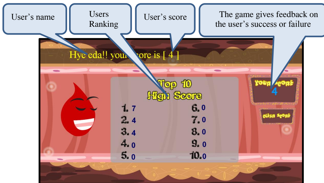
Figure 2. Example of Feedback Elements that was Implemented in Game Design