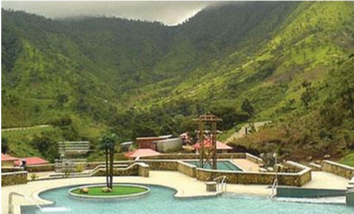
Figure 1: The landscape of Obudu cattle ranch