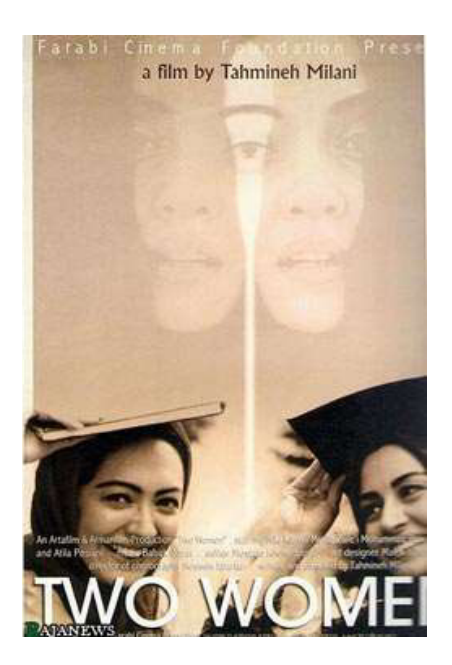
Fig. 4.Two Women, 1999.

Any portrait conveys a special code and making use of a specific picture means a special code. To understand this code, one must not only know the face but also the movements and the behavior attributed to that face. It makes the perception of the code better. Modern methods such as billboards have made the job easier and conveying messages through faces have been facilitated through technological advances. These facilities have accelerated the creation of the message and sending it as well. Now the question arises: how can we picture that mood revealed in a certain person? We should first know the person and record one of his/her moods for conveying that certain message. Or we impose different moods to the person and then record them.