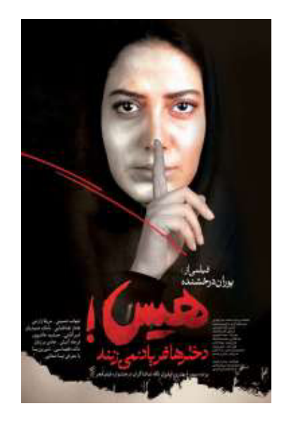
Fig. 2.Hush!Girls don't scream,2013.

In other countries, they have made use of faces in graphic as a means of sending message as well. One of the areas that portrait has been so prominent is use it for cinema posters and cinema front. A total of 99% of posters used by film maker's benefits from actors' portraits to show the theme of the films. (Comedy, romantic, tragedy) In every corner of the world, a good film is a film that attracts common people. To advertise these films, we should know the common people's capabilities before designing the posters. Unfortunately, most of these posters are commercial and non-artistic. There are still graphic designers who can design actors and actress' faces in a way that not only express more meanings but also preserve the artistic and classic principles. How to make use of portrait in Iran depends on the time and people's social/political attitude. During the Islamic Revolution in Iran in 1978, because of excitement among people, posters showing faces were very affective. During that time, faces in posters showed crushing anger towards ex-regime. Street protesters' firsts came to help pictures. Posters showing faces expressed objections against royal regime and conveyed this message so deeply to the addressees.