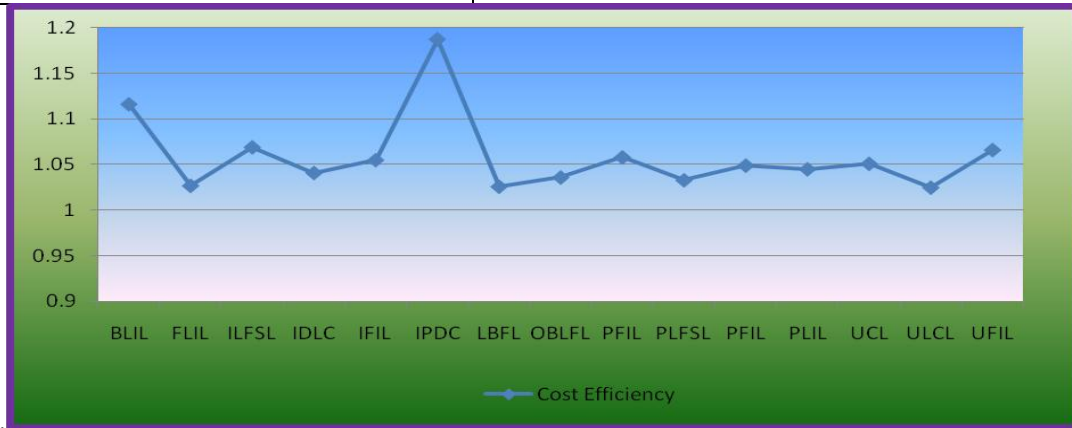
Fig. 2: Average Cost Efficiency of Selected Leasing Company using Stochastic Frontier Analysis