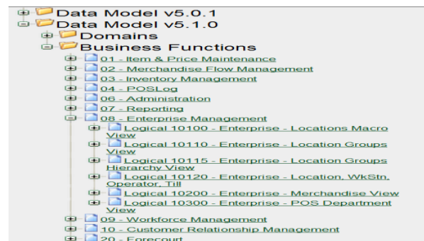
Figure 2. Screen Shot ARTS Ontology

Figure 2 is a screen shot ARTS. We considered using ARTS because it has a comprehensive definition and outline of retail concepts and properties which makes it easier for us to customize without difficulty. ARTS ontology provides the basic standards for retail stores to build specific functionalities. ARTS ontology provides a general framework that could be used to develop functions peculiar to the domain being modelled, and the functions or tasks it should exhibit. From the template we choose to modify the customer relationship management component to enable us to predict the CLV of a customer.