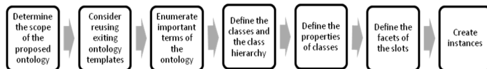
Figure 1. Adopted Method for Developing Ontological Tool

The Grüninger and Fox method for developing ontology has been adopted for its simplicity and vivid explanation of the processes involved. Figure 1 describes the processes.