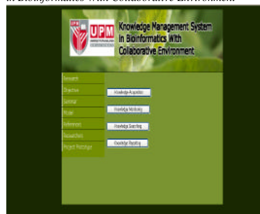
Figure 3: Knowledge Management System in Bioinformatics with Collaborative Environment Portal

Knowledge Mapping tool in the system will help the user of the system to map the document consists of certain knowledge to their category. For instances, the system user will key in the category of the knowledge that want to submit to the system. The category can be chose from existence categories or user construct a new category but with the system administrator permission. The permission in constructing a new category for the submitted knowledge is to avoid redundancies happened in the databases.