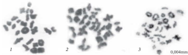
Fig. 2. Chromosomes of Arion spp. in the diakinesis (meiosis) ( n ): 1 — A. distinctus ; 2 — A. fasciatus ; 3 — A. fuscus .

chromosomes are represented by submetacentrics ( sm ); the remaining pairs are metacentric ( m ) (fig. 1, 2). The chromosomal formula is 2n = 44m + 6sm + 2st = 52 . The fundamental number is FN = 104 (Garbar, Kadlubovska, 2014).