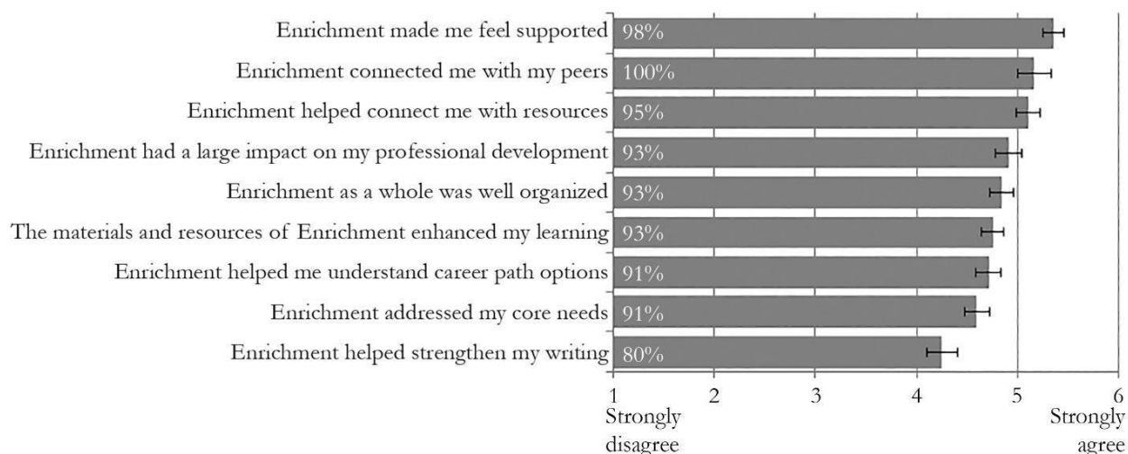
Figure 2. “Course evaluation” data from seniors completing EXITO at the primary university.

A total of 57 seniors completed course evaluations and rated Enrichment on a Likert scale of 1 ( strongly disagree ) to 6 ( strongly agree ). Mean and standard error are shown, with scholar percentage agreement (rating >3 ) inset. Items denote 57 responses except for “career path” and “writing” questions ( n = 56 ) and “connecting with peers” ( n = 24 ; asked of Cohort 3 only).