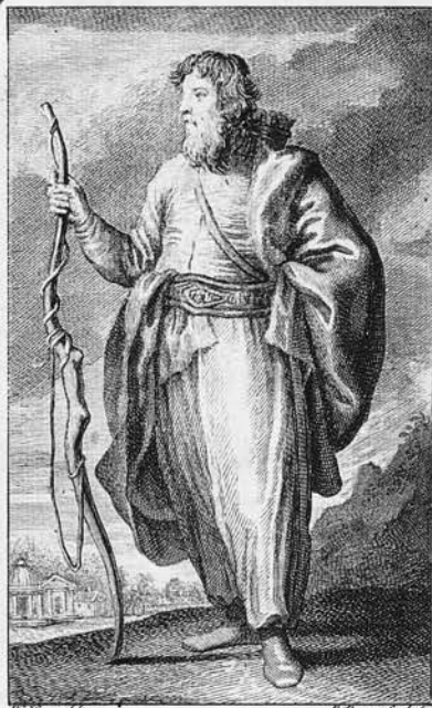
BLADUD, To whom the GRECIANS gave the Name of ABARIS.