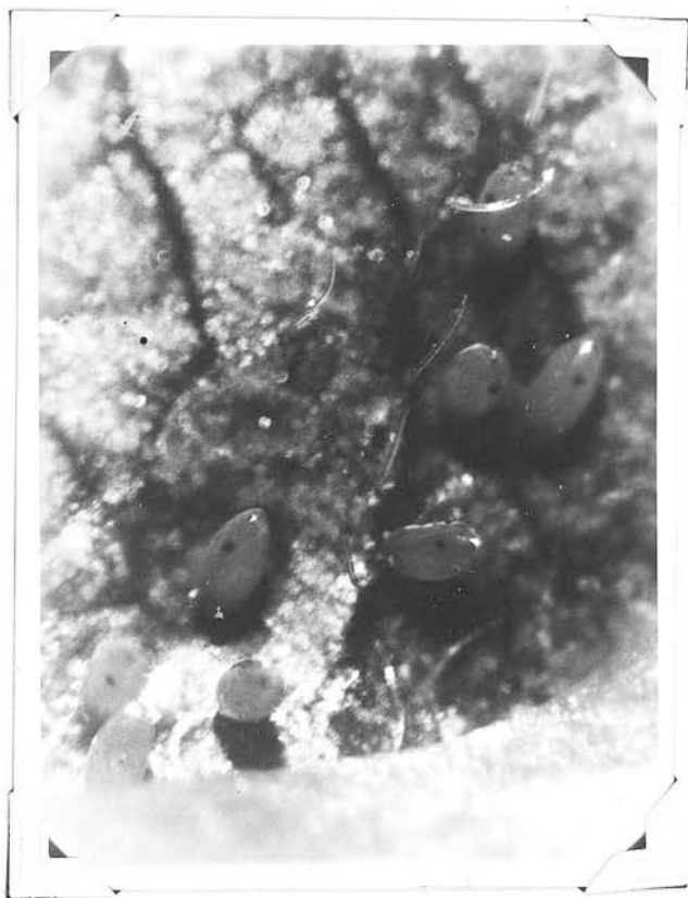
Photomicrograph of a portion of hawthorn, Crataegus oxycantha , leaf showing a group of eggs deposited by Psyllia melanoneura Först.