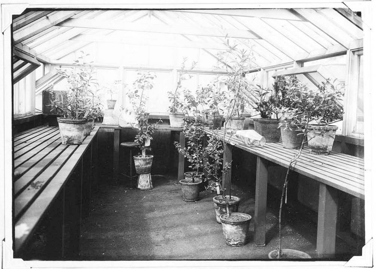
Green-house, attached to the department of Agricultural Zoology, University of Edinburgh, showing the host plants of species of Psyllidae and two of the cellophane cages in which the latter were confined for various experimental purposes.