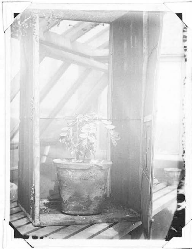
A small plant of ash, Fraxinus excelsior , in a wire-gauze cage, heavily infested with Psyllopsiis fraxinicola Först and P. discrepans Flor and nearly succumbing to the attack.