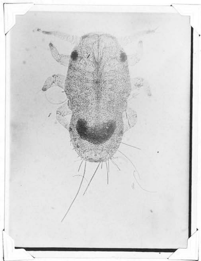
A photomicrograph of a second stage nymph of Psyllopsis fraxinicola Forst showing some of the long shafts of white waxy secretion arising at the bases of the lanceolate setae surrounding the abdominal and the costal margins.