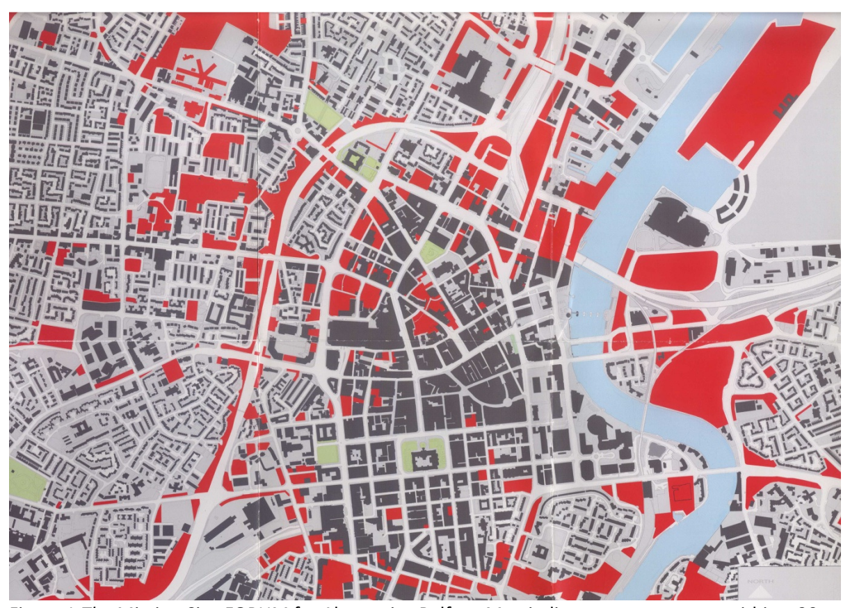
Figure 1 The Missing City, FORUM for Alternative Belfast. Map indicates vacant spaces within a 20 minute walk from the Belfast city centre in red.

in a mix-matched way without being well thought out". <sup>38</sup> In turn, these housing complexes were all geared toward a young generation, fresh from university, flush with new earnings and not yet needing family accommodation. It worked for a time, but when the bubble burst and the economy crashed, this generation no longer had the means to afford such high-end accommodations. The multi-person families who needed and could afford downtown accommodation were ignored, even though they would have provided a long-term settled population to the area which still struggles to keep people after nightfall. The city also failed to provide community necessities such as grocery stores, schools, and doctors within walking distance. What could have become the heart of a progressively reunified city became a failure due to the city's eye toward capital gain rather than a dedication to providing what the population truly needed.