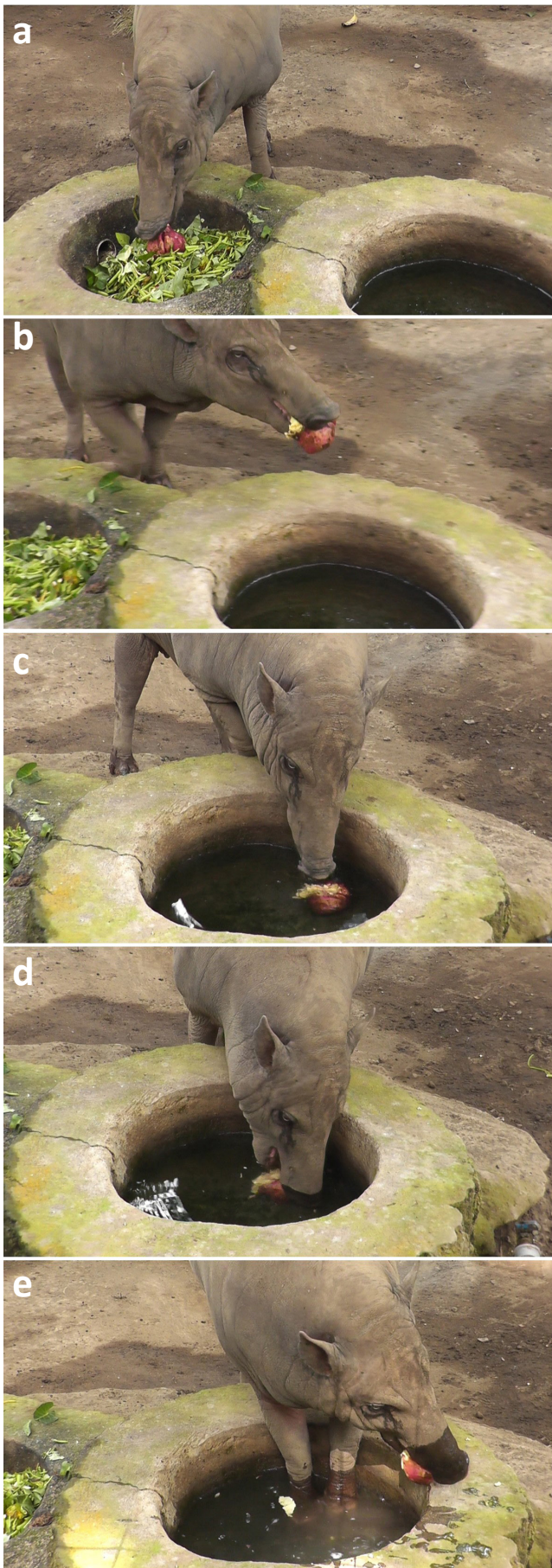
Figure 5. a) A female babirusa, Priska, bit into the narrow part of a clean, large-sized (200 g) piece of sweet potato ( Ipomoea batatas ). b) She carried the large sweet potato to the water trough. c) She dropped the sweet potato and it sank into the water. d) Priska retrieved the sweet potato. e) Priska chewed the water-dipped, sweet potato. Note the watermark on her snout.