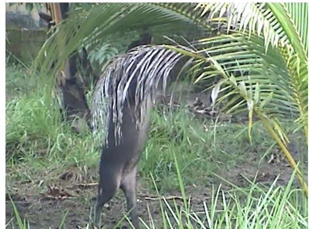
Figure 1. A female babirusa, Shela, standing on her hind limbs to reach tree leaves.

the juvenile males that climbed onto the feed troughs were covered in the black sand from the enclosure. Based on these preliminary observations, a series of experimental studies was designed to look more closely at factors that might influence this food preparation behaviour in babirusa. Would the adult