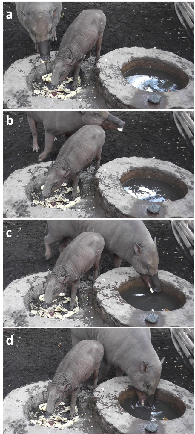
Figure 3. a) A female babirusa, Shela, picked up a piece of cut sweet potato ( Ipomoea batatas ), made sandy by the feet of her juvenile male, Toti. b) Shela walked round behind Toti with the sweet potato in her mouth. c) Shela reached the water trough to dip the sandy sweet potato in water. d) Shela dipping the sandy piece of potato in the water.

In videos taken in July 2012, three of the babirusa (the two adult females and one sub-adult male) were seen to dip an item of their food into water before eating it. In each case the animal put a piece of sweet potato in its mouth, carried it to the water trough, dipped it into the water, chewed it and then swallowed it (Figure 2). This was observed on 32 recorded occasions amounting to 81 min 22 sec over a period of six days. On one occasion (video, 11 July 2012), Shela held a piece of feed in her mouth when she walked round the rear of Toti, who was blocking her way to the water (Figure 3). On another occasion, after dipping a piece of sweet potato in the water trough, Tito began to eat it, but dropped it on the ground behind the water trough. He walked round the trough to pick up the piece (now partially covered in sand), carried