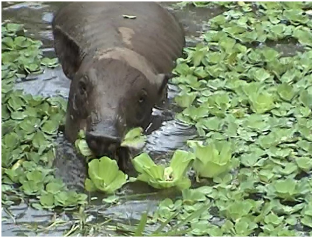
Figure 7. A female babirusa, Shela, immersed in water and eating fresh water lettuce ( Pistia stratiotes ).