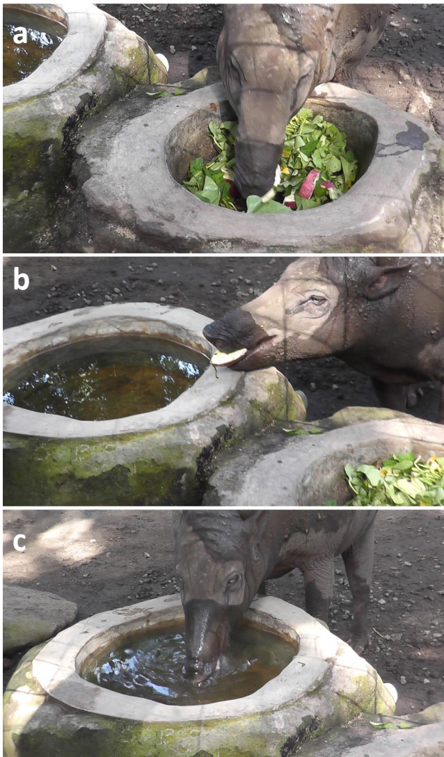
Figure 2. a) A female babirusa, Priska, holding a 65 g piece of sweet potato ( Ipomoea batatas ) in her mouth. b) She carries the sweet potato to the water trough. c) She dips the sweet potato deep into the trough. Note the watermark on her nose.

end of any period of feeding, and the variation in the frequency of the water-dipping food preparation behaviour, these durations were normalised on a relative scale of 0 to 100 (from start to finish).