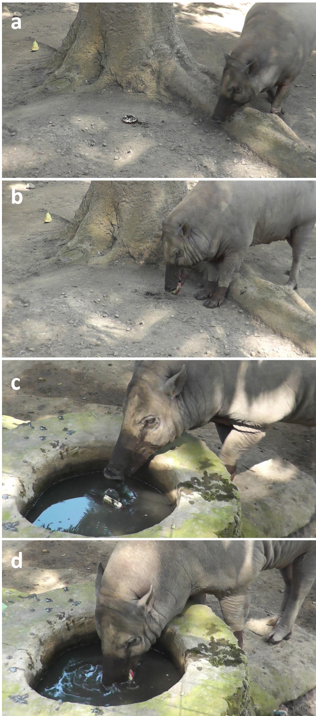
Figure 4. a) A female babirusa, Priska, noticed a piece of “sandy slice of sweet potato” ( Ipomoea batatas ) placed on the ground 1.5 m away from the water trough. b) Priska placed the sweet potato in her mouth. c) The moment when the dropped food made contact with the water surface. d) Priska lifted up the sweet potato out of the water.