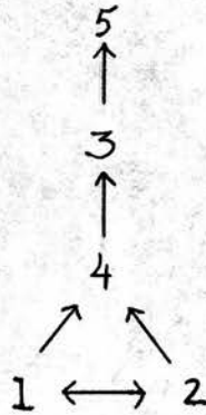
FIGURE 1 Results of Ordering Theory Analysis (Experiment 2)

Ordering Theory (Bart & Krus 1973) analyses the relationship between pairs of items. Results are presented in Figure 1. Here a single-headed arrow between two items indicates that, within the 5% level of significance, success on the 'origin' item was an operational prerequisite for success on the 'insertion' item. It will be noted that Items 1, 4, 3, 5 form a continuous branch which, due to the operation of transitivity, may be considered as a single linear dimension. Clearly this finding corroborates that of the Scalogram Analysis. However, Items 1 and 2 are found to be equivalent in terms of prerequisite relationships with each other and the other items.