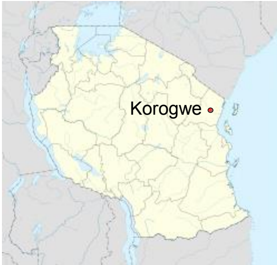
Figure 1: Map of Tanzania and location of Korogwe (Coe 2006).

In November of 2013, I arrived in Korogwe, a town in north-eastern Tanzania where the third phase of the RTS,S clinical trial was being conducted. The town of Korogwe is situated within Korogwe District, in the Tanga Region. As of the 2012 Tanzanian population and housing census, the town of Korogwe had a population of 68,308 and Korogwe District had a population of 242,038. Korogwe is a road junction that connects the cities of Dar es Salaam and Arusha and is located 280 kilometres from Dar es Salaam, 340 kilometres from Arusha, and about 100 kilometres inland from Tanga town on the Indian Ocean.