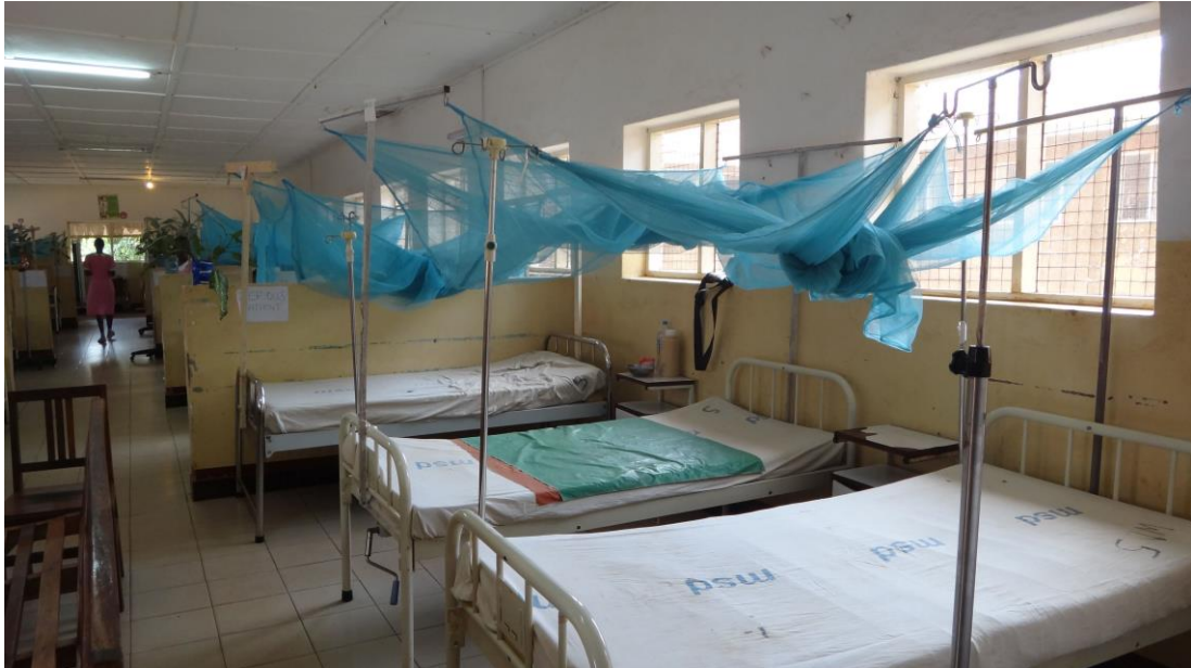
Figure 6: The pediatric ward of the Korogwe District Hospital.

Since there was no backup generator, the lights would turn off and the ceiling fans would stop their lazy rotations when the power went off from time to time. I watched caregivers and children cycle through the ward, leaving after treatment or being given a prescription, or being shown to a bed for treatment. Nurses with latex gloves used a glucometer to test children and employed syringes and sample tubes to collect blood from children. Caregivers and nurses comforted children and health care providers recorded diagnoses and prescriptions in new school exercise books that could later be taken to a pharmacist to request drugs. If a child was ill, health care providers asked caregivers questions and filled out paper laboratory forms to document information about the patient. When a child was a participant of the RTS,S trial, different paper forms were filled out to record names, biometric data and other information. These forms were then moved, along with tissue samples, to the laboratories at the Korogwe Research Centre. As Whyte (2011) argues, writing and recording information on paper are performances that transpire during medical research and during health care provision, affirming their similarity. However, the resources and well-paid staff in this ward set it apart from the other hospital wards, helping reinforce the differences between the public and privately-funded health care providers.