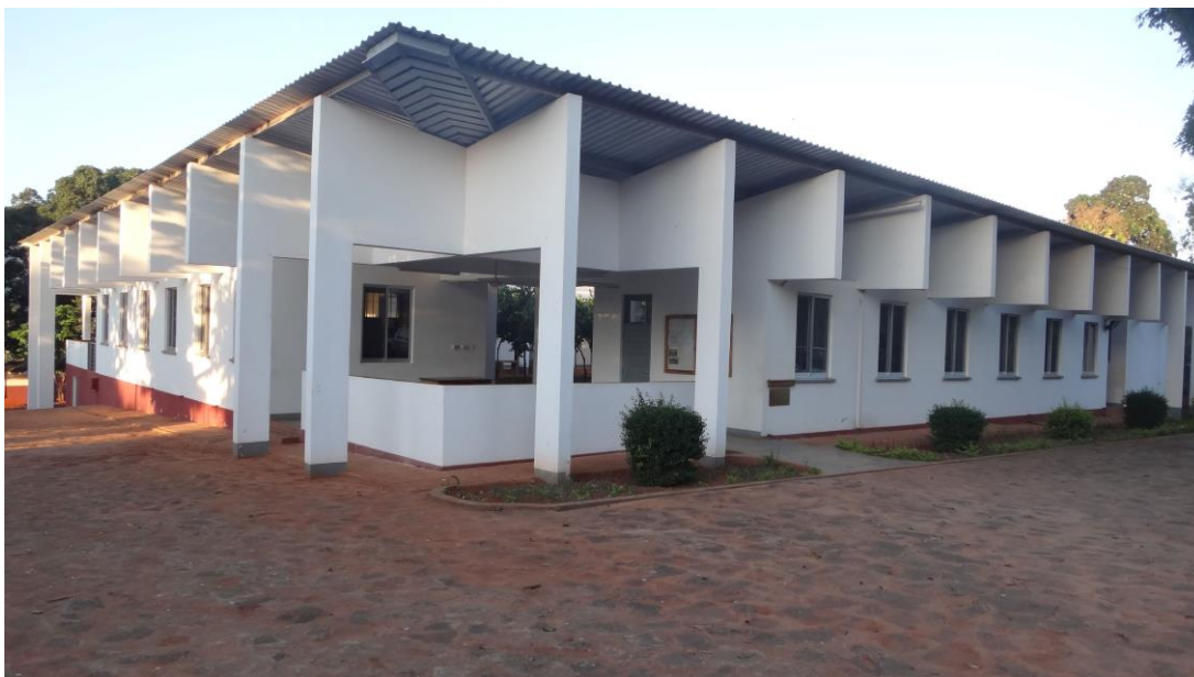
Figure 3: The Korogwe Research Centre.