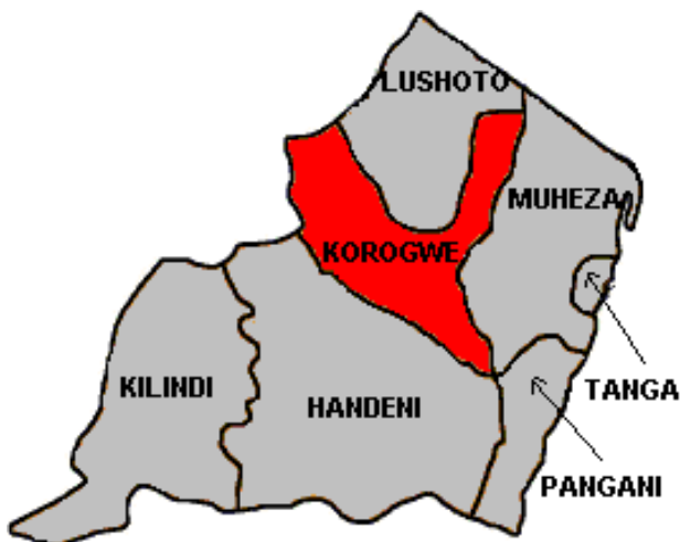
Figure 2: A close up of the districts of Tanga Region with Korogwe District highlighted and Handeni District below (Coe 2006).