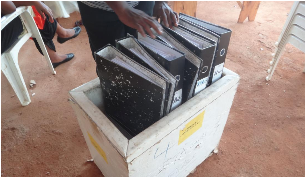
Figure 9: Trial participant files in Styrofoam box.

Most children were calm during this process but some cried. A few children looked scared but the nurse was able to reassure them or make them laugh as she weighed and measure them. One little boy became very upset when the nurse tried to take his temperature. His mother looked embarrassed and apologized to the nurse while trying to get the child to accept having his temperature taken. The nurse gave the boy a lollipop in an attempt to appease him, but in the end the mother and nurse had to hold the boy down so they could get a reading from the thermometer. A few children cried when the nurse approached them and refused to step on the scale to be weighed. Caregivers helped calm and reassure these children by holding their hands or speaking softly to them. All of these interactions slowed down the process of collecting biometric data and trial staff attempted to conceal their frustration and calmly deal with participants and caregivers, even as they felt the pressure to complete the process quickly so participants could move onto the next stage.