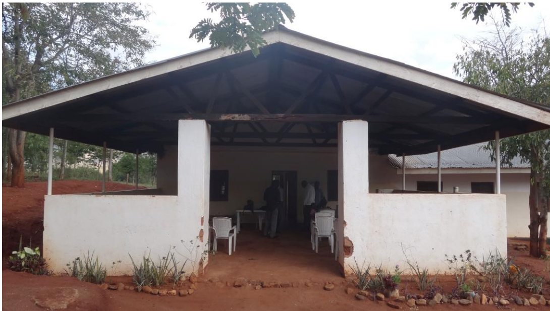
Figure 4: Trial dispensary.

the shrewd ability of researchers to establish partnerships and draw funding from transnational organizations to establish the laboratory in Korogwe.