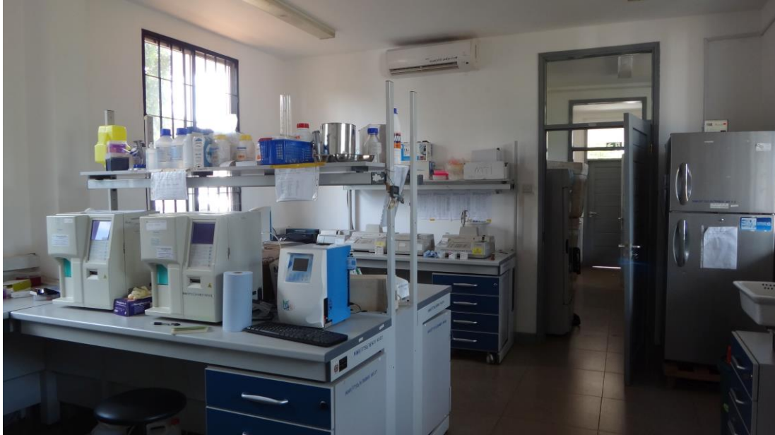
Figure 5: The haematology laboratory.