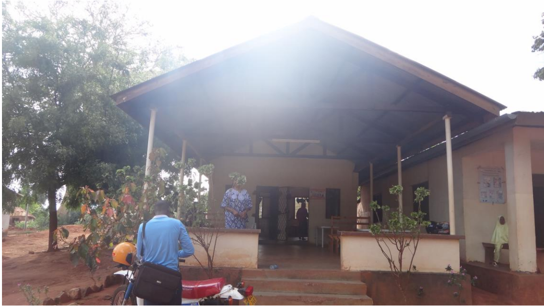
Figure 7: Trial dispensary next to a government dispensary.

Through the trial dispensaries, trial participants and community members could receive enhanced care. Each of the dispensaries built to support the trial were located near a government dispensary and when the government dispensaries were busy or experiencing stock-outs of drugs, government staff would direct caregivers with children to visit the trial dispensary to receive health care and drugs. One afternoon when I was spending time in a trial dispensary, a young mother came in with her infant who was breathing heavily. The baby was not a trial participant but the clinic officer examined the baby, placing a stethoscope on its tiny chest to listen to its breathing. He explained to the mother that her baby had an infection. The clinic officer gave the mother a handful of medications and marked the visit and the prescribed medications in a log book after they left. These drugs were provided free of charge from the trial's US$7,000 a month drug budget.