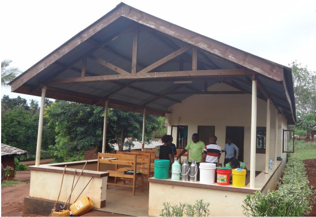
Figure 8: Trial dispensary.

Once caregivers and participants arrived at the dispensary, they sat on the wooden benches and waited for their child's name to be called by a nurse. At the table set up on the porch, a nurse and fieldworker filled out the first page of the five-page form with information found in participant files, including the name of the participant and their caregiver, name of their village and sub-village, name of the village leader, house number, and date of birth. Once this was completed for each participant, the nurse and fieldworker began calling out the name of participants. This was a signal for caregivers to bring their child to be seen by the nurse and fieldworker who took each child's temperature by placing a thermometer under their arm. Once taken, the temperature was recorded on the form. If a fever was discovered, that was noted in the file, which signalled to trial staff that the child would need to be tested for malaria using a Rapid Diagnostic Test for malaria (mRDT) after their blood was drawn. Each child was weighed on a scale, and their height and their arm circumference were measured, with this information recorded on the five-page form.