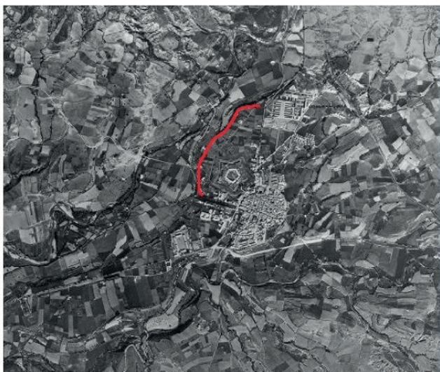
A) In 1957