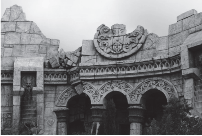
Fig. 4: The producers of theme parks recognize the power of Atlantis. Here is seen a part of the Atlantis attraction at the Universal Orlando Resort, in Florida, U.S.A. Universal also has an attraction titled The Wizarding World of Harry Potter. At least visitors realize that Harry Potter is entirely fictional. I hope.

In his book, Atlantis: the Antediluvian World , Ignatius Donnelly ends on an optimistic note concerning the future discovery of archaeological evidence that will convince even hard-nosed skeptics that Atlantis was just exactly as Critias (through Plato) described it and what he, Donnelly believed it to have been, the source of human cultural development: