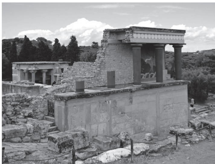
Fig. 1: Photograph showing a small, reconstructed and refurbished segment of the expansive palace of Knossos on Crete. Photo: Bernard Gagnon, Wikimedia. https://en.wikipedia.org/wiki/Knossos#/media/File:Knossos_-_North_Portico_02.jpg , accessed 1 November 2016.

islands in the Mediterranean. Crete's geographic position in the Mediterranean allowed for its control of trade in the region and it became a dominant maritime power with important harbors and a large fleet of seaworthy ships.