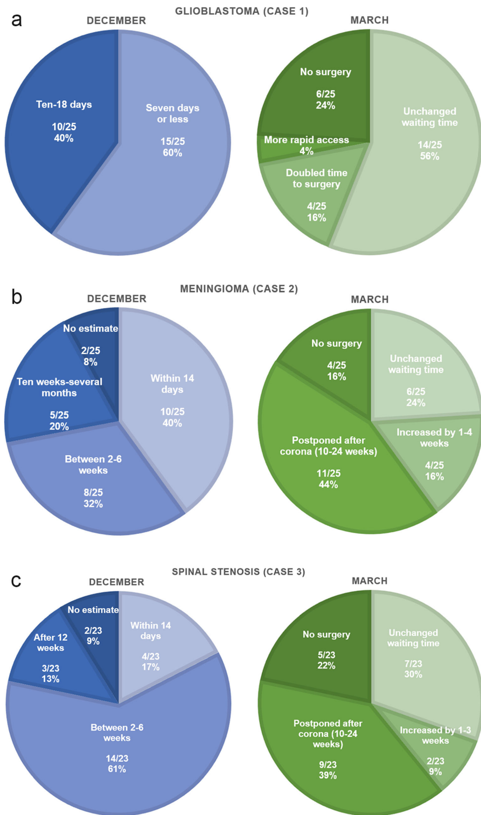
Fig. 2 a–c Expected time to surgery in December and March for the elective patients 1–3