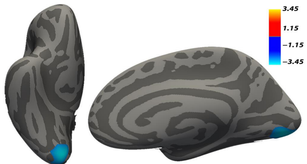
Figure 2. The increased cortical surface area in Neglect versus Control groups. The cluster comprises lingual and lateral occipital regions. Background brain images represent the inferior ( left image) and medial ( right image) views of the right inflated hemisphere (FreeSurfer) fsaverage brain. Note: p < 0.05 cluster-wise corrected, 10,000 Monte Carlo iterations, age, total intracranial volume (TIV) and Psychiatric Disorders were used as nuisance covariates for the cortical surface area analysis.

The results in the cortical surface area, applying a CFT = 0.001, revealed a significant pattern of greater surface area in mothers of the NG with respect to the CG (CG < NG) in the occipitotemporal region previously hypothesized. The analysis showed a large cluster ( p = 0.0002 , see Table 3 bottom and Figure 2) extending over the right lingual and lateral occipital gyri of the right hemisphere.