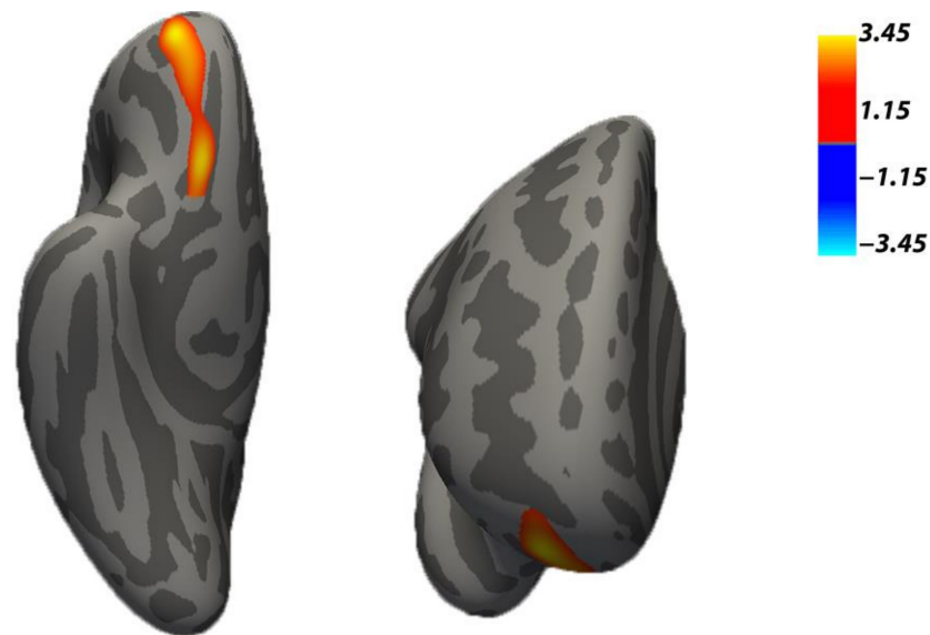
Figure 1. The cortical thickness reduction in Neglect versus Control groups. The cluster comprises the right rostral middle frontal gyrus, as part of the dorsolateral frontal gyrus, and the lateral and medial orbitofrontal areas. Background brain images represent the inferior ( left image) and anterior ( right image) views of the right inflated hemisphere of (FreeSurfer) fsaverage brain. Note: p < 0.05 cluster-wise corrected, 10,000 Monte Carlo iterations, age, and Psychiatric Disorders were included as nuisance covariates for the cortical thickness analysis.

The results in the cortical surface area, applying a CFT = 0.001, revealed a significant pattern of greater surface area in mothers of the NG with respect to the CG (CG < NG) in the occipitotemporal region previously hypothesized. The analysis showed a large cluster ( p = 0.0002 , see Table 3 bottom and Figure 2) extending over the right lingual and lateral occipital gyri of the right hemisphere.