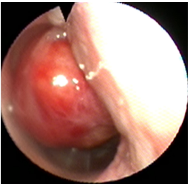
Fig. 1 – Endoscopy of the nasopharynx

Due to the lack of improvement in nasal obstruction two months later, the patient was qualified for endoscopic surgery to remove the tumor nasopharynx, uncomplicated postoperative course. Histopathological research showed the classical Hodgkin's lymphoma (a type of "lymphocyte - Rich"), immunophenotype cells Reed - Sternberg: CD 30+, CD15+, MUM 1+ 5 + PAX, Ki-67+, CD3-, CD20-, bcl2-, EBV-, LMP-Ab1-, PD1-, CD4-macroscopically; irregular, beige fragments of tissue, including of dimensions. 1.5 \text{ cm} \times 1.3 \text{ cm} \times 0.4 \text{ cm} .