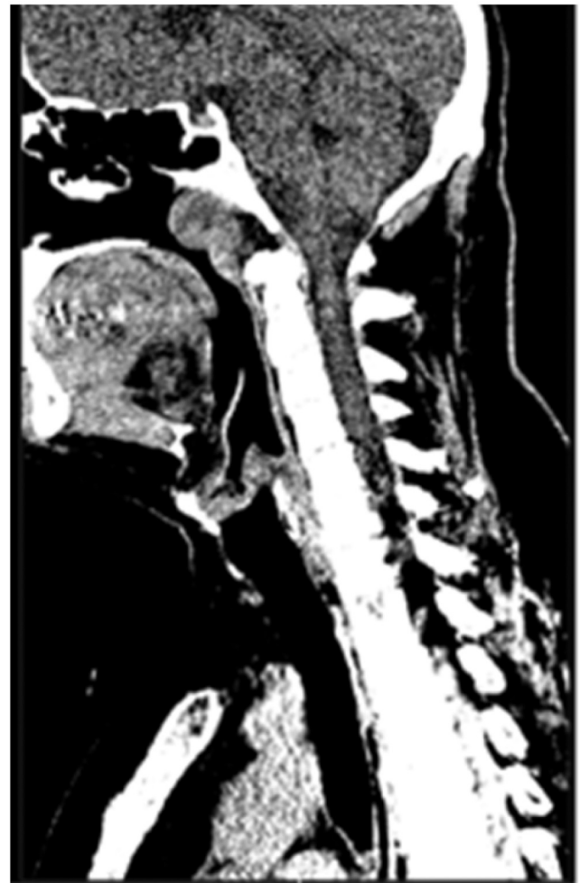
Fig. 3 – Computer tomography scan of the neck sagittal projection