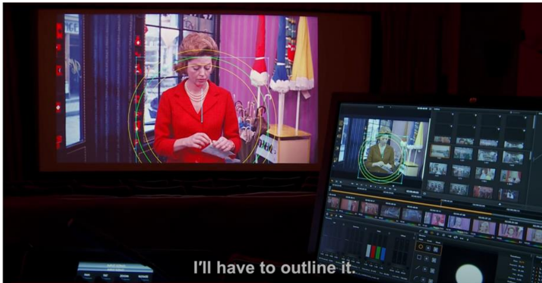
Figure 5. Screenshot from the digital restoration demo of The Umbrellas of Cherbourg (1964).