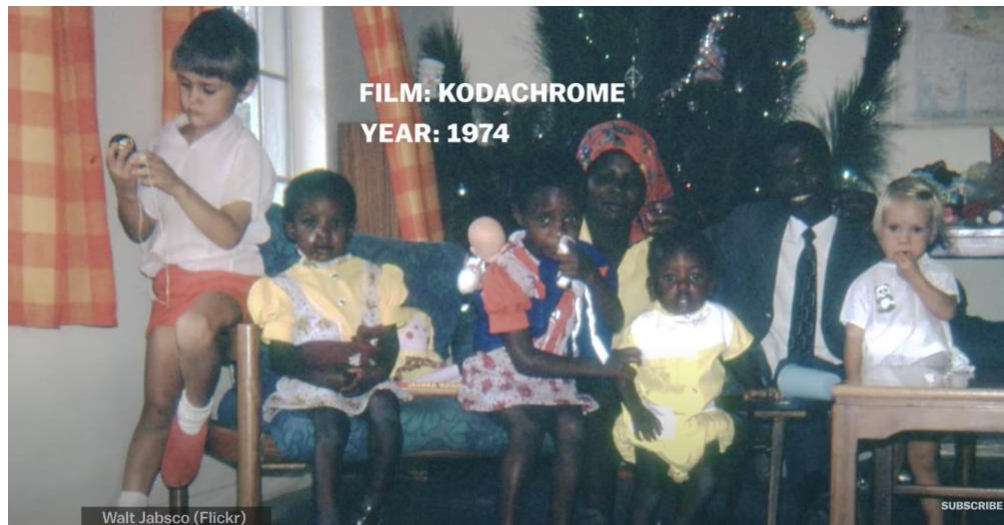
Figure 2. Sample shot of Kodachrome’s inability to capture dark skin tones from “Color film was built for white people. Here's what it did to dark skin” video.

lighting tests for MGM in 1942, the skin of light-skinned Black actress was deemed to not effectively “signal blackness,” leading to the development of a particular make-up shade, “Light Egyptian” to enhance it (see Pullen 2014, 94-5).