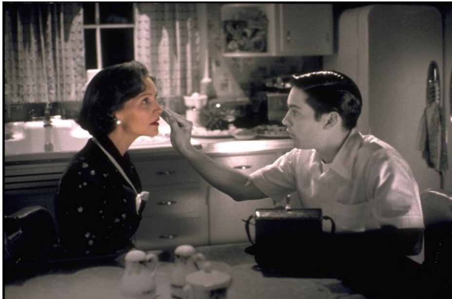
Figure 1. The dramatized removal of skin tone in Pleasantville (1998).