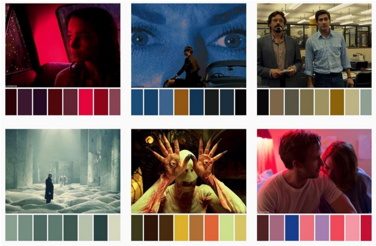
Figure 6. A screenshot from Instagram account ColorPalette.Cinema.