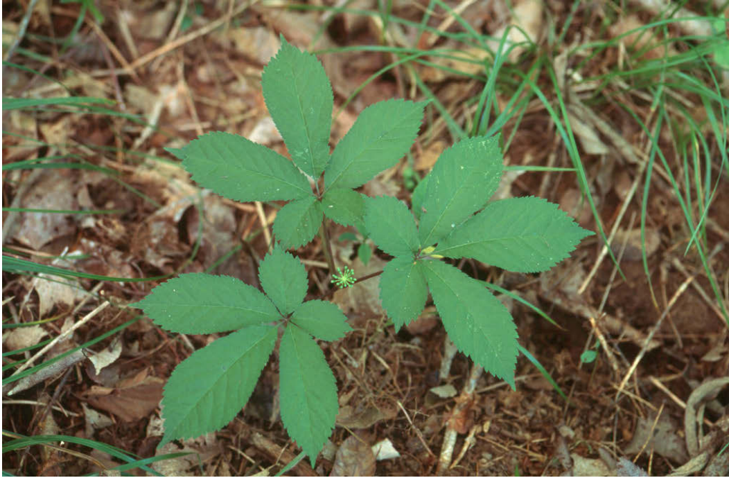
Ginseng with Flower