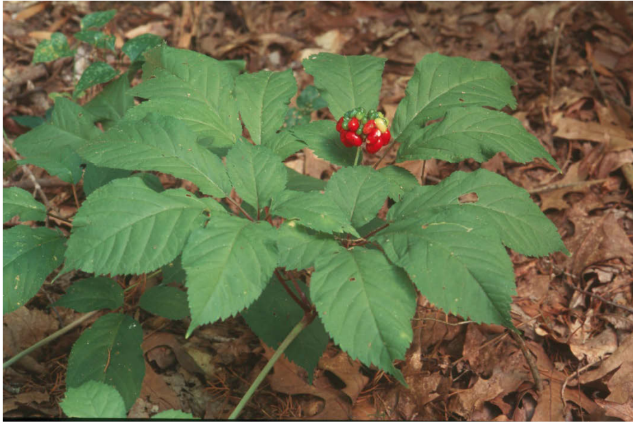
Ginseng with Fruit