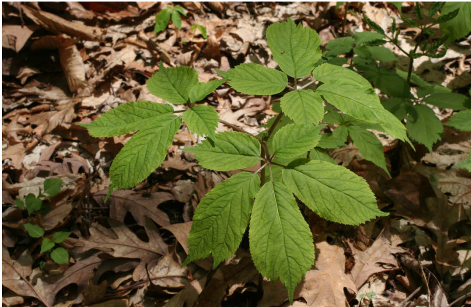
Ginseng at Five Leaf Stage of Development