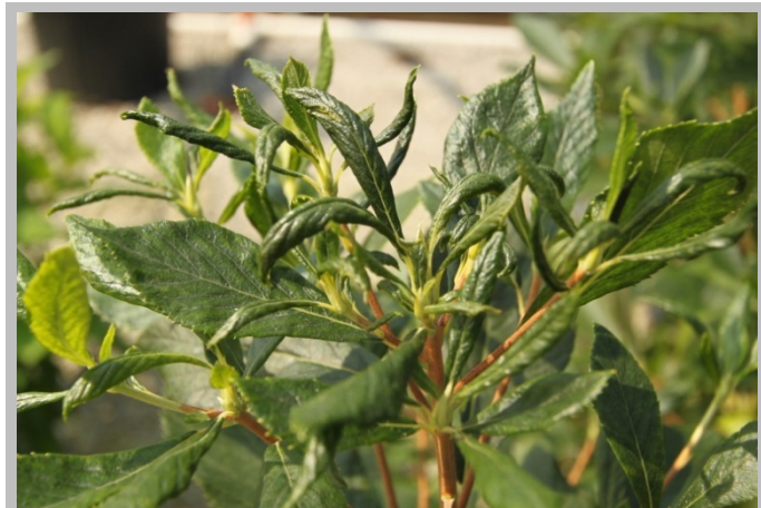
Image 3. Broad mite feeding damage on this Clethra sp. plant has resulted in small, stunted and cupped-shaped leaves that are slightly darker than the older unaffected leaves below.

Rotating chemical classes or modes of action is always wise, but this is especially important for broad mites because of their rapid lifecycle. Their ability to have multiple generations per year allows populations to quickly develop miticide resistance.