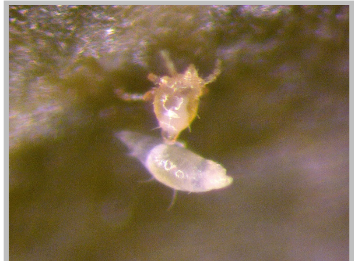
Image 5. An adult male broad mite is carrying a quiescent female. He may carry her to a new plant and begin a new generation.