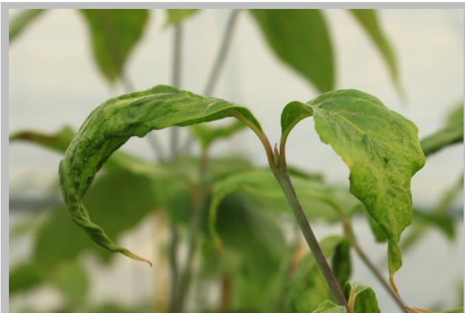
Image 1. The leaves on this dogwood ( Cornus florida ) plant are stunted, strap-like and curling downward in response to broad mite feeding.

Broad mites ( Polyphagotarsonemus latus ) are a species of small mites that damage many ornamental crops. They are most active during the warmer summer months but they may be active year round in a greenhouse. If not controlled in time, feeding damage can result in unmarketable plants. Broad mites typically feed on the newest growth, which eventually becomes deformed and stunted. Broad mites are almost impossible to see with the naked eye and are best viewed with a strong hand lens or microscope.