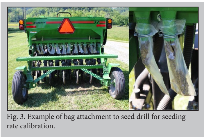
Fig. 3. Example of bag attachment to seed drill for seeding rate calibration.

Step 2: Remove hoses from beneath native grass box and attach pre-weighed bags under seed cups using the hose clamps (Fig. 3).