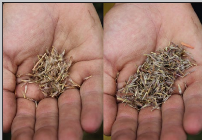
Fig. 4. Little Bluestem 'Aldous' seed from different seed companies. The seed on the left may have greater fluffiness which could make it more difficult to flow through the seed drill at a regular rate.

Not all seed is the same. Even seed that is of the same species and variety may be different depending on the way they were cleaned. This will differ based on the seed supplier you order seed from. Figure 4 shows two types of seed that are the same species and variety (Little Bluestem 'Aldous') but from different suppliers.