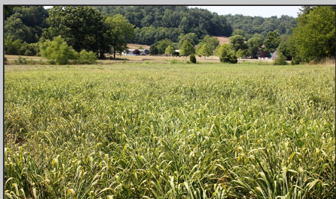
Fig. 2. Field of Eastern gamagrass in Giles County during the 2012 drought (June 29). The field had already been cut and was regrowing well while other pastures (background) were no longer productive.

These grasses, therefore, could be used under summer drought conditions to maintain a herd until conditions improved.