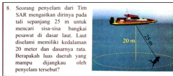
Figure 2. Non-routine Problem in BSM

Besides analyzing the non-routine problem, researchers also found some similarities and differences between the two textbooks as shown in Table 2. Both NSM and BSM have discovery activities in their textbook for students to discover the concepts by themselves, promoting student-centered exploration, and containing mostly contextual problems.