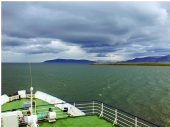
View from the RV Poseidon leaving Reykjavik (Isobel Yeo)