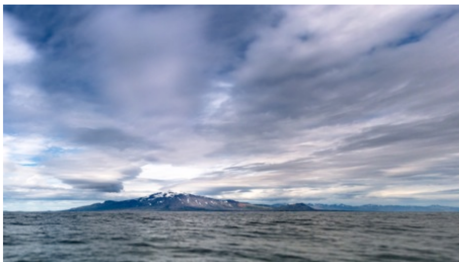
Snaefellsjokull glacier seen from RV Poseidon on transit (Nico Augustin)

Most of the science party moved onboard the RV Poseidon on the 13.07.2016 with a few members joining on the 14th. The majority of time on both days was spent installing the ROV PHOCA control container and the ROV winch onto the back deck and mobilising the vehicle. A harbour test of the ROV was carried out successfully on the afternoon of the 14 th .