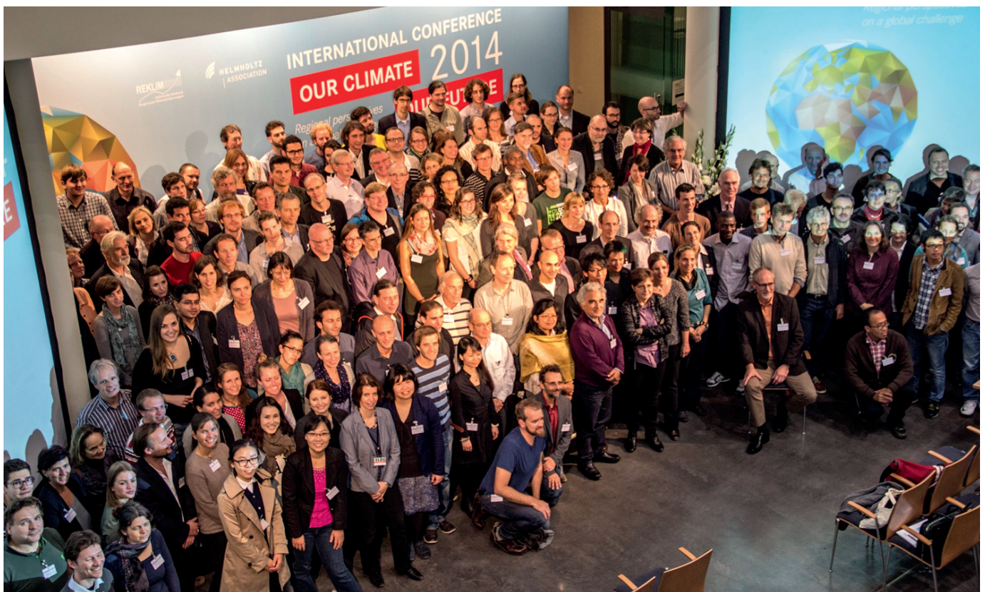
Fig. 2: Group picture of the participants of the REKLIM international conference 2014, Berlin, Germany.

The GERMAN SOCIETY OF POLAR RESEARCH and the ALFRED WEGENER INSTITUTE HELMHOLTZ CENTRE FOR POLAR AND MARINE RESEARCH (AWI) offered to publish a conference volume of all papers related to the Arctic and Antarctic realms, as well as to all aspects on polar climate. The POLAR-FORSCHUNG (Polar Research) editors and the scientific steering committee (see authors of this contribution) of the conference welcomed original papers, scientific review articles and extended abstracts from natural as well as societal and