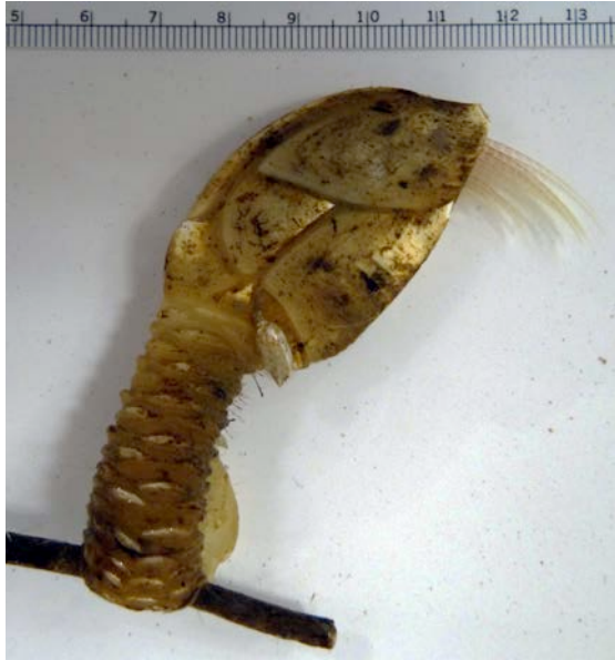
This large goose barnacle - presumably a member of the Lepadidae - was caught on the Stalemate Ridge at about 3,000 m depth. (Alexander Ziegler)