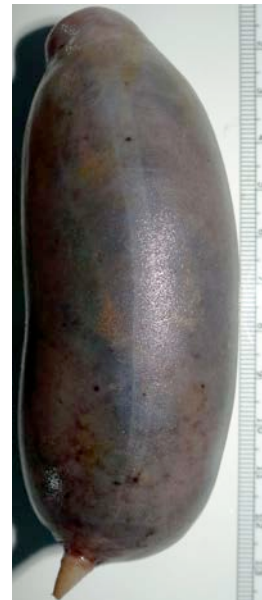
This odd-shaped specimen is in fact a member of a group of sea cucumbers predominantly found in the deep sea. It was captured on Detroit seamount at about 4,100 m depth. (Alexander Ziegler)