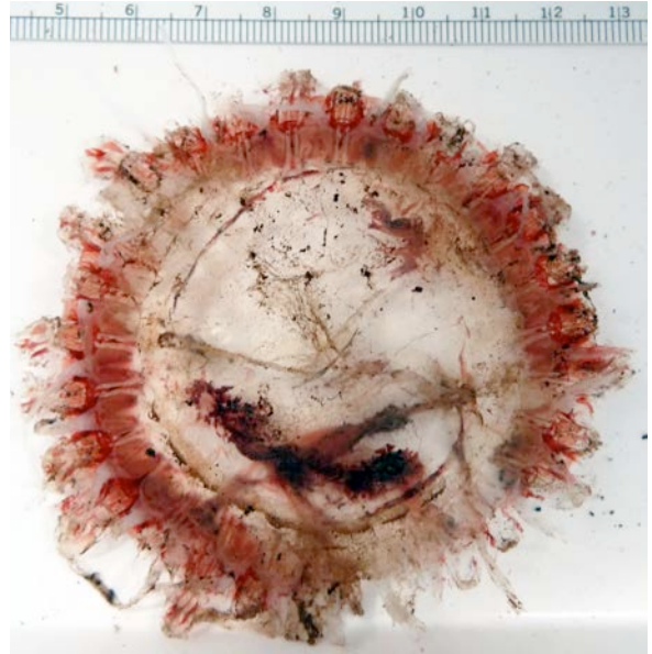
Jellyfish can also be found in the deep sea. This so-called coronate medusa ( Atolla sp.) was dredged at about 3,200 m depth S of Detroit seamount. (Alexander Ziegler)