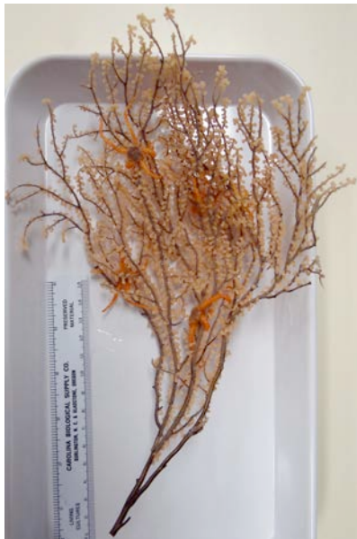
This gorgonian deep-sea coral dredged at about 2,200 m depth on Detroit seamount provided shelter for six brittle stars. (Alexander Ziegler)