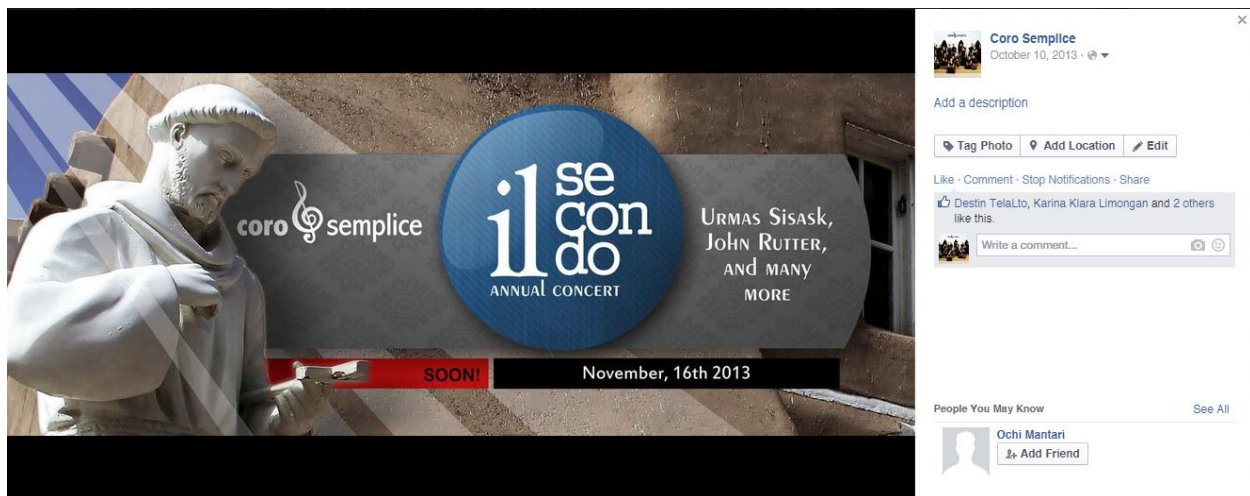
Picture 9. Cover Ill secondo, Coro Semplice Indonesia

Media get a least response is the social media cover. The passive and incomplete material, makes this media have a response as 32 people only. This media is considered monotonous because of the lack of significant updates for 3 months. On the other hand the media is able to provide a warning to the audience who opening the Coro Semplice members social media pages. The warning was able to give direction to the audience to read or access other media fuller.