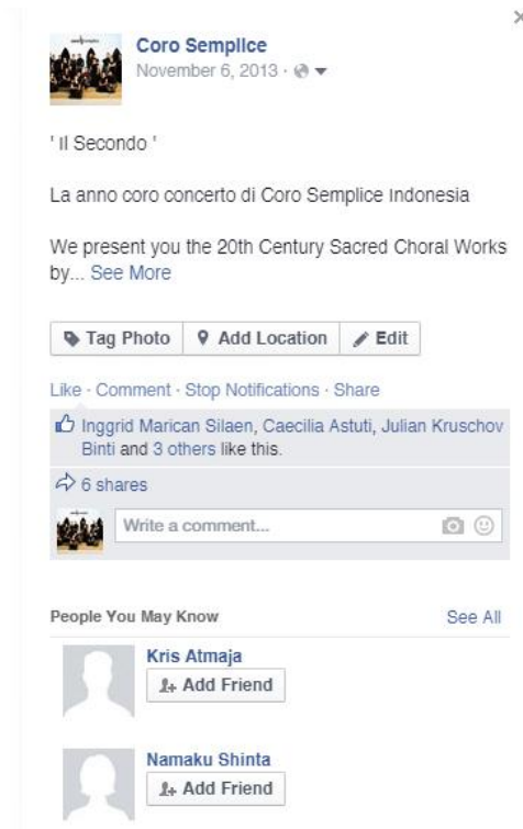
Picture 6. Poster Online, Il Secondo , Coro Semplice Indonesia