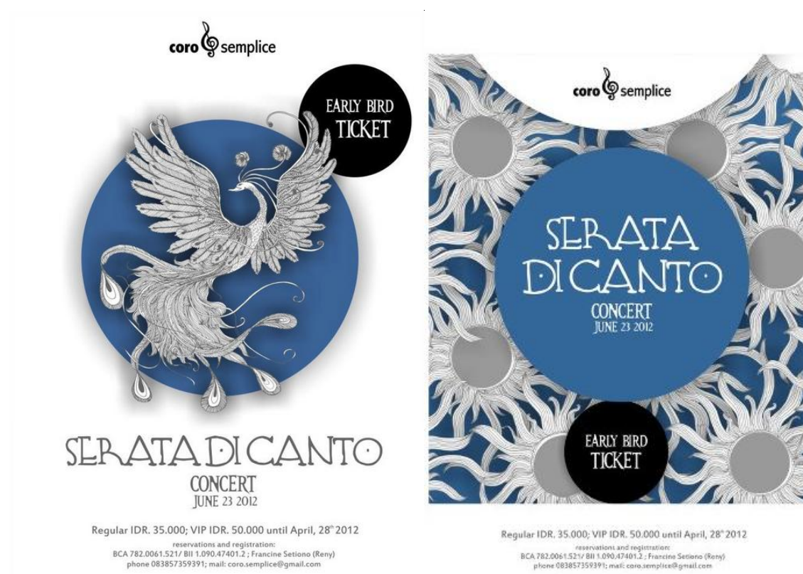
Picture 2. Poster Offline, Serata Di Canto Concert, Coro Semplice Indonesia