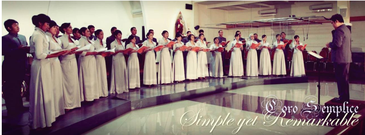
Picture 1. Coro Semplice Indonesia

Coro Semplice Indonesia has a very limited space funding. So that all of expenditure in each activity should think about its effectiveness. Included, in the ad spend such as the ad for Serata Di Canto concerts 2012, Ill Secondo concerts, 2013, and Canto Al Cielo concerts 2014. This concert activity to provide awareness of Coro Semplice to the audience also should invites the audience to attend the concert.