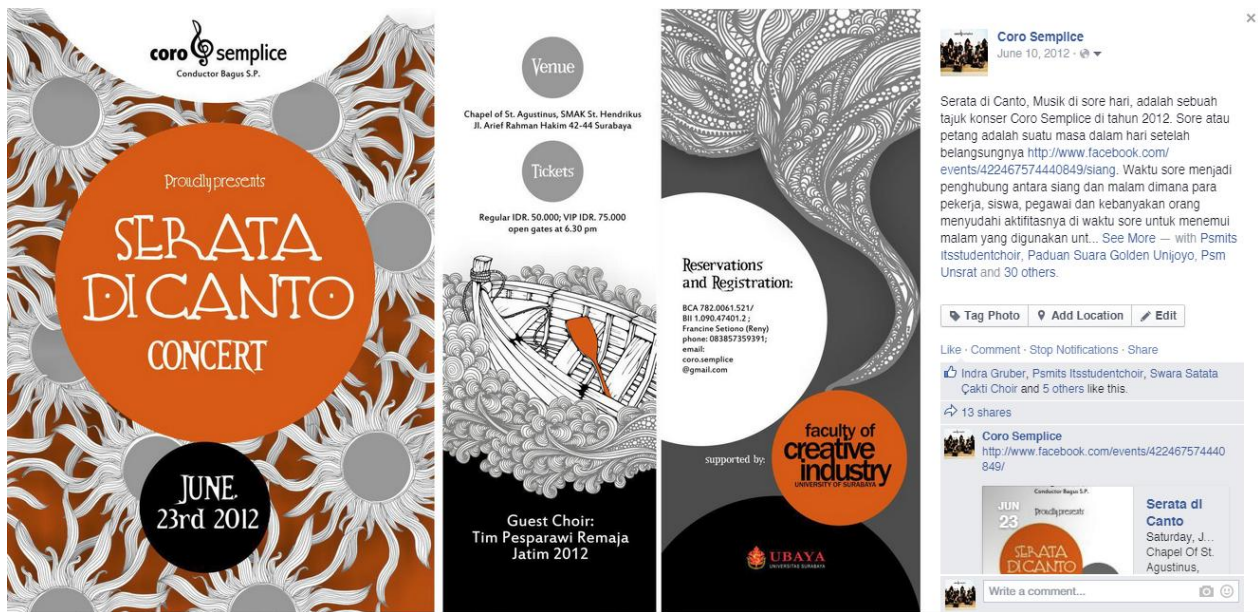
Picture 4. Poster Online, Serata Di Canto Concert, Coro Semplice Indonesia