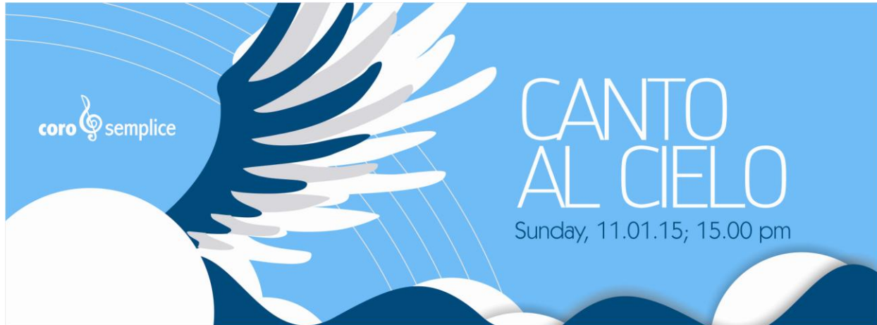
Picture 7. Poster Online, Serata Di Canto Concert, Coro Semplice Indonesia