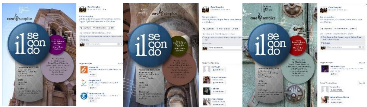
Picture 5. Poster Online, Il Secondo, Coro Semplice Indonesia