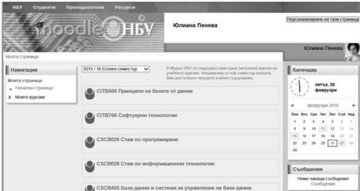
Fig. 2 Moodle My Courses panel

As it concerns the maintenance, Moodle is supported by a large international group of users and developers. One of its strong points is the active online learning communities and collaboration activities. Blackboard also has its own organized communities. Though Blackboard is a commercial LMS, while Moodle has always been open source, the engagement of each product with its community of users is different.