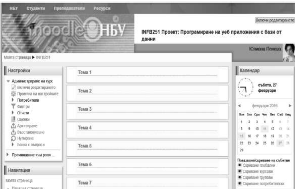
Fig. 4 Moodle organization

Organization in Moodle is not by type of content, but by week or topic (Fig.4), like a regular class syllabus. This format permits the instructors to decide what activities to do week by week or unit by unit, which does not constrain any learning style or teaching methodology. Although Blackboard does not limit the content, the inherent structure behind the Blackboard course shell could constrain the way an instructor designs the learning paths for the course.